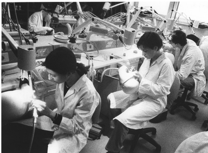
Figure 11: Practical work of dental medicine students.

coursework means establishing connections between clinical cases and preclinical theoretical knowledge (vertical connectivity) and vice-versa. This introduces clinical cases already in the first year of studies. The second approach is problem-based learning (PBL), which focuses on students' knowledge of the most frequent clinical signs that lead a patient to see a doctor. The essence of this approach is that students meet their professor in smaller groups, come to class with a certain knowledge they obtained from books, and professors then present clinical cases. This method of learning is much more strenuous for both professors and students than the traditional formats, but brings better results in the long-term memorization of professional knowledge and in connecting it to cases. Modern trends of medical teaching also include an early contact with patients, as this allows students to learn about medical ethics sooner, establish a better quality relationship with a patient and communicate with them. In practice this means that when a student first approaches a patient (for example during introduction