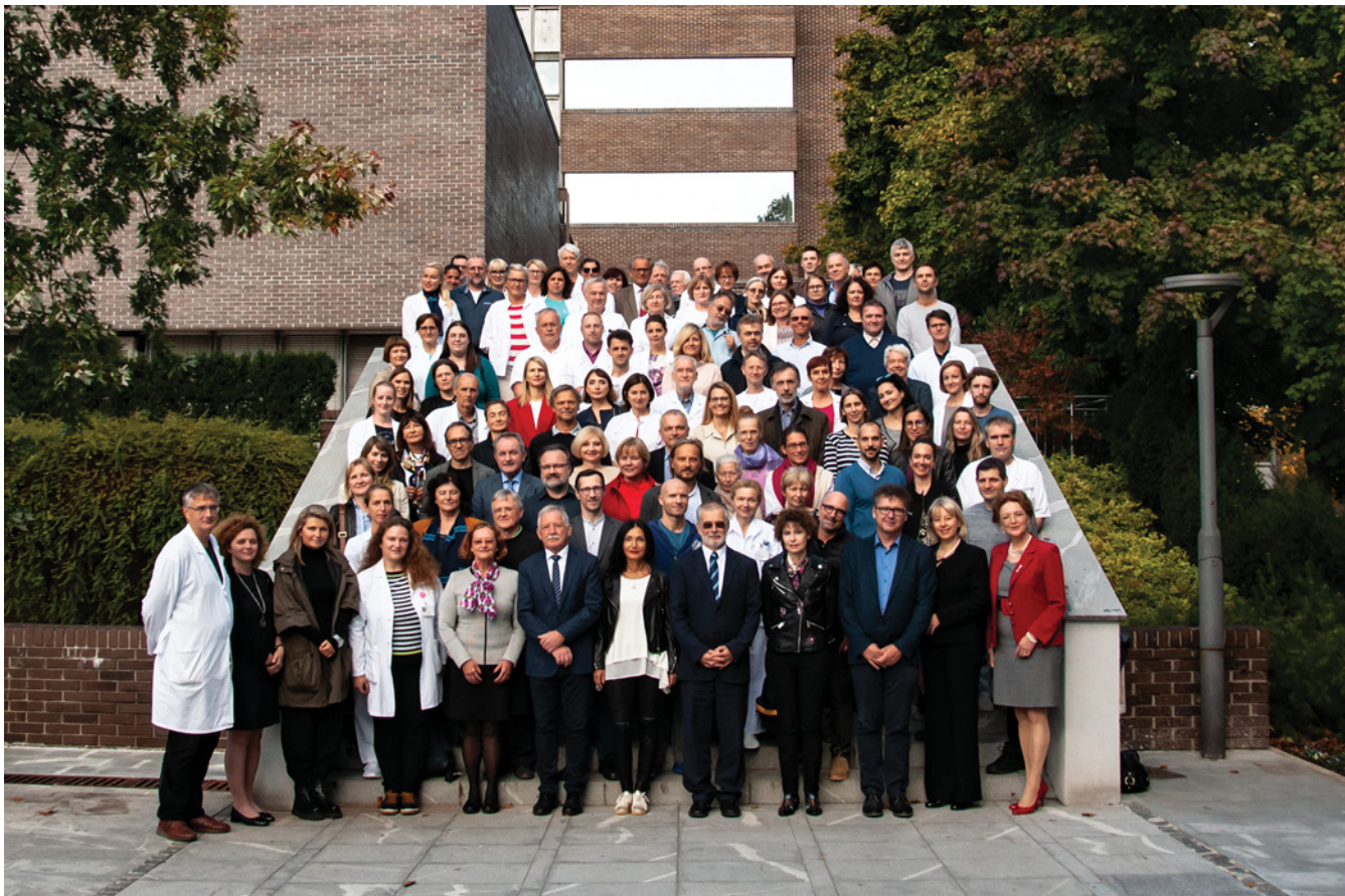
Figure 12: A part of the professorial staff of the Faculty of Medicine, University of Ljubljana, 2019.

were women and 495 were men, with 1206 studying medicine and 371 dental medicine. In the same year, the doctoral study had 371 students. In 2018 the Ljubljana Faculty of Medicine had 261 physicians graduating (180 women and 81 men), as well as 56 dentists (45 women and 11 men) (28).