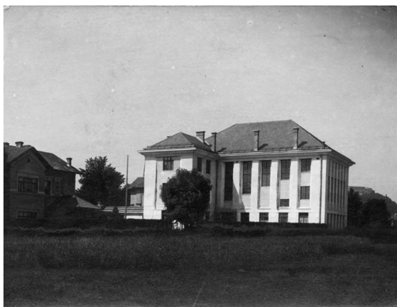
Figure 2: The first building of the incomplete Faculty of Medicine on Zaloška Road 4 in Ljubljana, the work of the architect Ivan Vurnik.

of 1848 the advancement of medicine in Slovenia was stifled. After that there was no longer much talk of a medical faculty in Slovenia. Medical doctors orga-