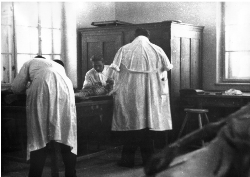
Figure 3: Practical work at the Faculty of Medicine's Institute of Anatomy during the interwar period.

the Faculty of Architecture and a student of Vienna professor Otto Wagner, was selected as the architect (11). (Figure 2)