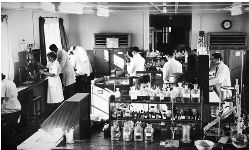
Figure 4: Laboratory practical work in chemistry.