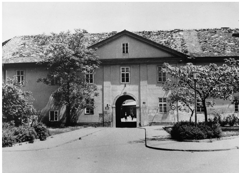
Figure 5: After World War 2 St. Peter's Barracks in Ljubljana became the seat of the full Faculty of Medicine.

in Ljubljana, which were then refitted as the Oražen Student Housing. Since 1925 and until today over 1000 students of the University of Ljubljana lived there free of charge, mostly medical students after the full faculty of medicine was established (14).