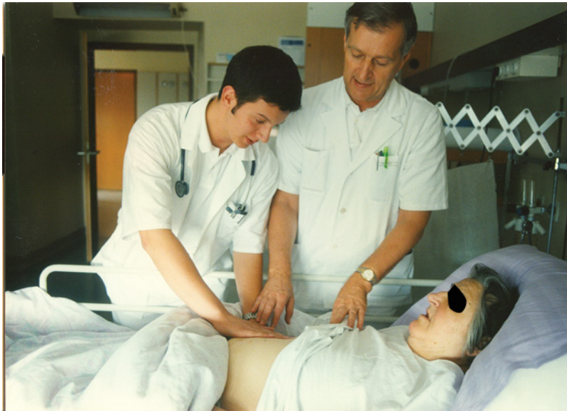
Figure 10: An important part of the study of medicine is clinical practical work on patients.

29 divisions, the Institute of Radiology, Institute for Blood Transfusion, Institute of Oncology and other. MF is also formally an integral part of the medical system and Slovenian healthcare, as its central task is to educate a sufficient number of medical doctors and dentists to treat the population (25).