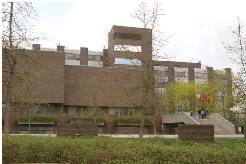
Figure 9: The long-awaited new building of the Faculty of Medicine on Korytkova Street, completed in 1987.

the faculty's duty to make sure that the students received in-depth knowledge across all the professions. For students these classes were elective. The condition for comprehensive study was for a candidate to first complete their basics obligations, and there was a contest for students to join the in-depth studies. Each institution opened a certain number of positions every year and every profession had to prepare a curriculum for in-depth studies. The faculty took the same initiative to introduce the one-year residency (23). (Figure 8)