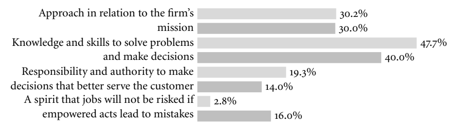
FIGURE 2 Conditions for active involvement of employees in the relation marketing concept (light gray – firms, dark gray – experts)

sible, and to refer to the results of the sub-process, related to data analysis and improvement.