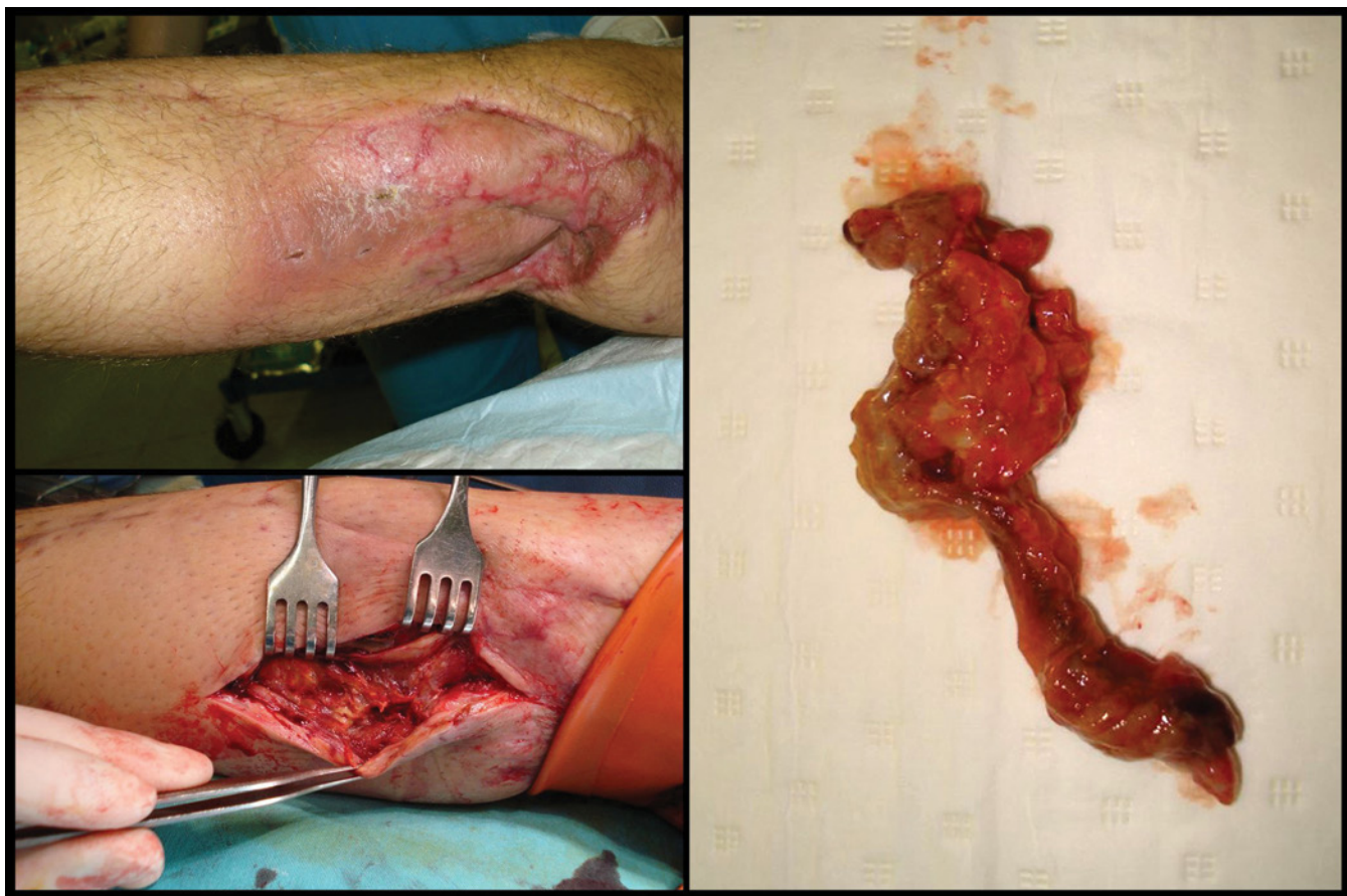
Figure 4: 108 days after the injury – surgical revision with additional necrectomy of subcutaneous tissue.

and regular passive exercises were prescribed.