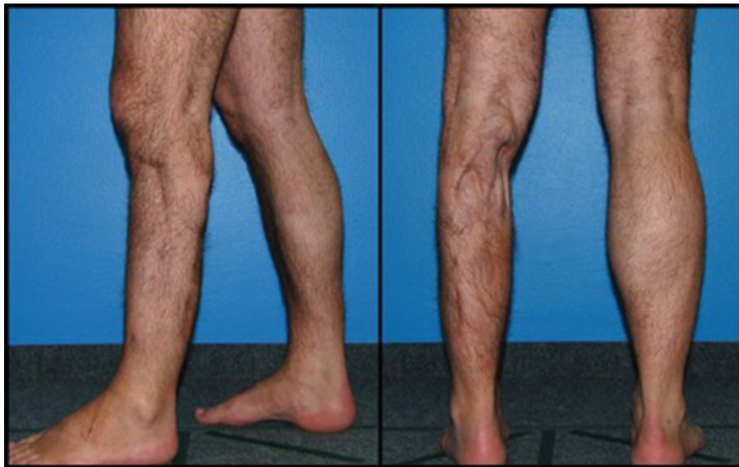
Figure 5: The end result about 1 year after the injury.