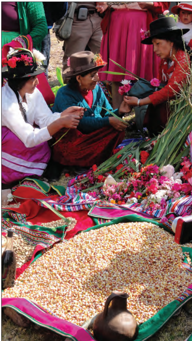
Figure 3: Ceremony for Pachamama (mother earth) in Soras Dist., Sucre, Ayacucho.

"In the past, troje (corn storage container) was organized very carefully. You put heavy rocks at the bottom and place flower-decorated twin corn cobs around them. On one side sits a decorated pot containing grains of all types and colors, and on the other side, a bottle of wine. The newly harvested cobs go on top of all that.