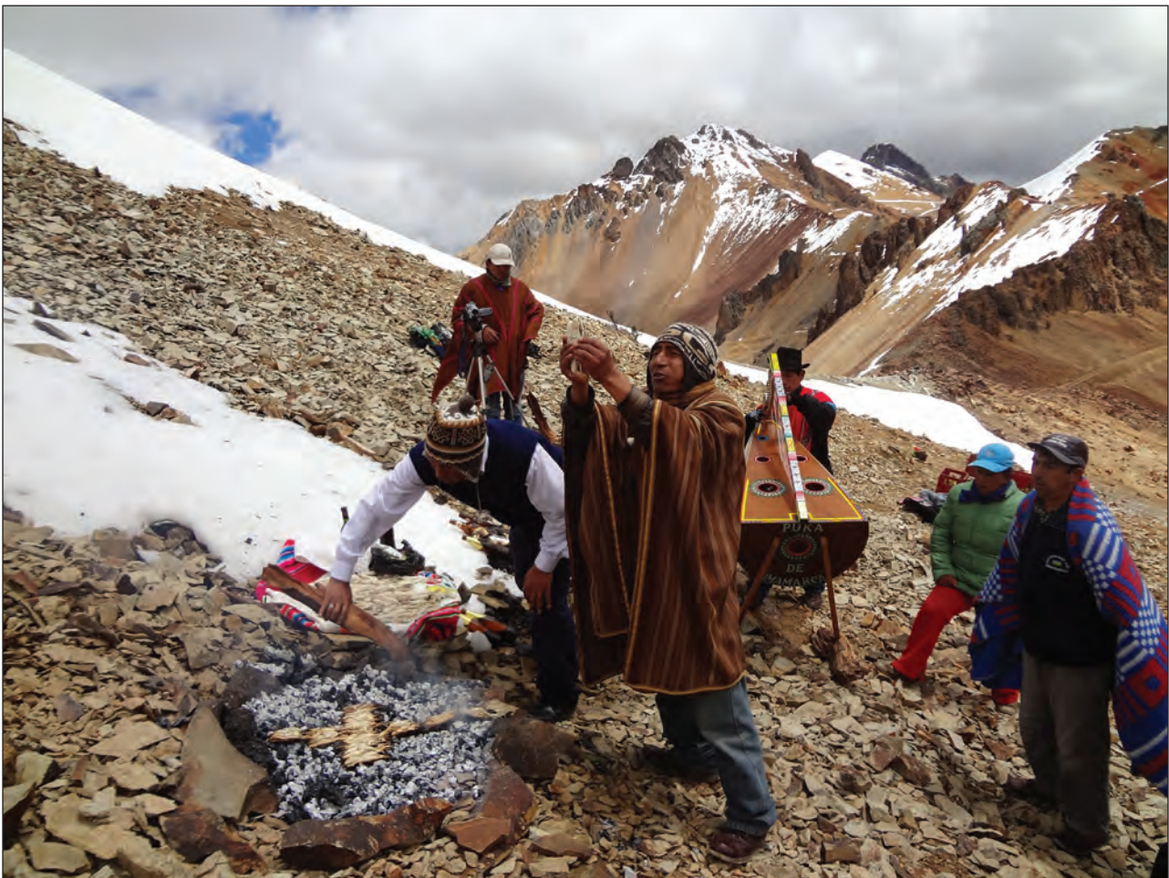
Figure 2: Ritual for mountain deity in Apu Qarwarasu (Courtesy of Mr. Adripino Jayo, Ayacucho, Peru).

elements, certain climatic phenomena and many types of animals and plants, including the crops themselves.