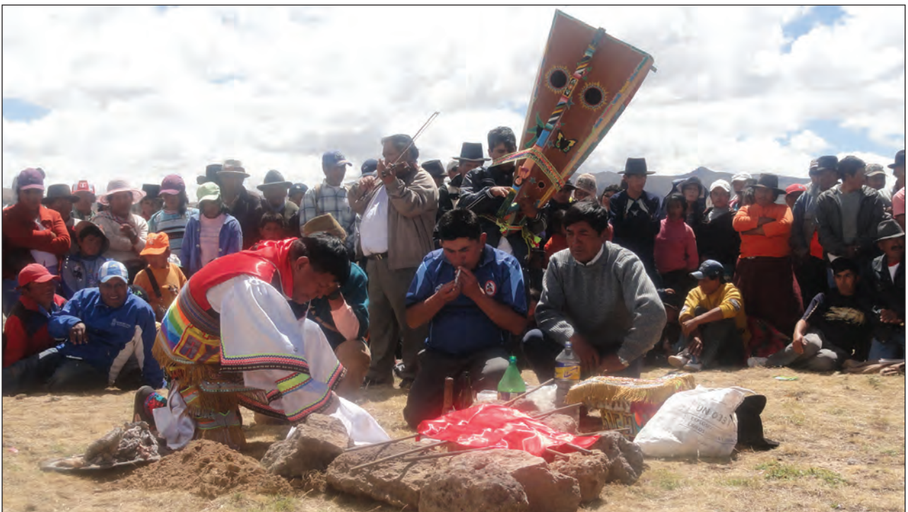
Figure 4: Preparation of an ofrenda (gift package) before planting corn, in Paico Dist., Sucre, Ayacucho.