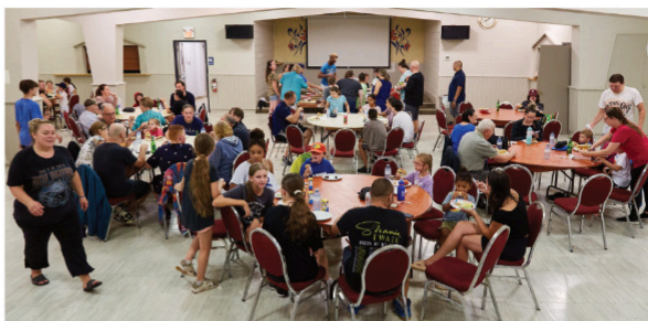
Day Camp memories from last year