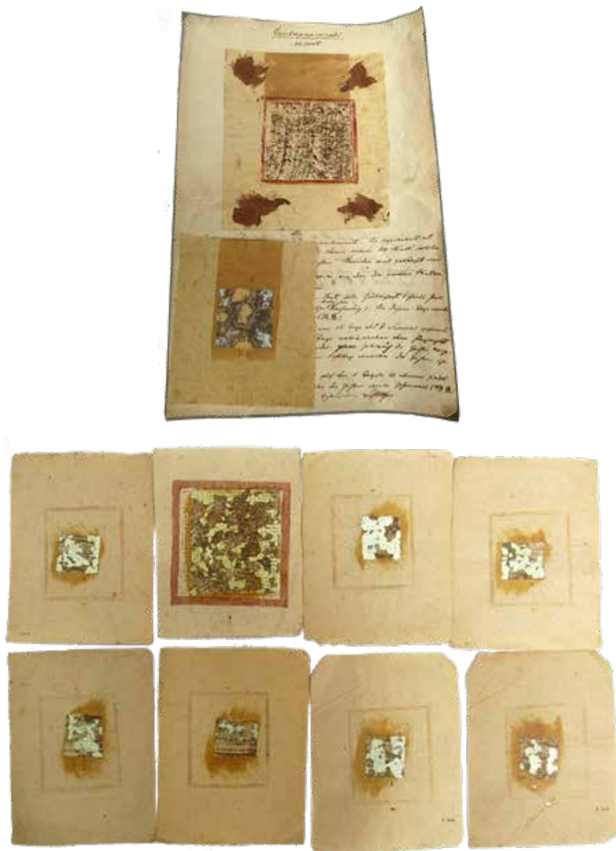
Figure 2: Paper money with handwritten notes by Alma Karlin, early 20th century, China (Alma M. Karlin Collection, Celje Regional Museum).