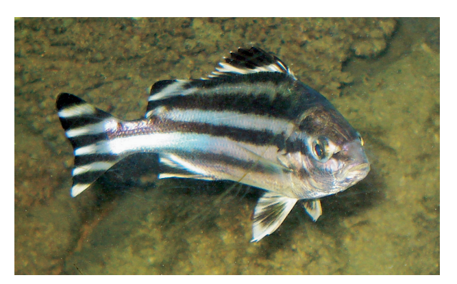
Fig. 3: Terapon (Terapon theraps) is a Lessepsian migrant, recorded in the Adriatic Sea. (Photo: B. Mavrič). Sl. 3: Terapon (Terapon theraps) je lesepska selivka, ujeta v Jadranskem morju. (Foto: B. Mavrič)

Historical temperature data and hydrological information favour the second hypothesis. Examples of invasive species in the Adriatic Sea include the following: the common dolphinfish ( Coryphaena hippurus ), the grey triggerfish ( Balistes capriscus ), the bluefish ( Poma tomus saltatrix ), the parrotfish ( Sparisoma cretense ), the round sardinella ( Sardinella aurita ), the Atlantic lizardfish ( Synodus saurus ), the Atlantic pomfret ( Brama brama ) and the European barracuda ( Sphyraena sphyraena ) (for a comprehensive review, see Dragičević & Dulčić, 2010; Dulčić & Dragičević; 2011). Some of these species, such as the bluefish, can affect local fisheries due to having a significant impact on the food chain. In the Adriatic,