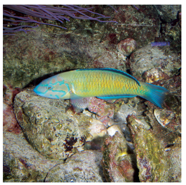
Fig. 1: Rainbow wrasse (Thalassoma pavo) is a northward spreading warm-water species.

In order to establish the relationship between the hydro-climatic variables and the pelagic species (sardine, anchovy and sprat), year-to-year fluctuations of small pelagic fish landings ( i.e. , the number of fish that are taken ashore) on the eastern Adriatic coast were compared with climatic fluctuations over the northern hemisphere and salinity fluctuations in the Adriatic (Grbec et al. , 2002). Using this approach, basic climatic oscillations were determined over a period of approximately 80 years, with which researchers found an correlation between climatic fluctuations over the northern hemisphere and small pelagic fish landings (Dulčić & Grbec, 2000; Grbec et al. , 2002). Bombace (1992) suggested that the