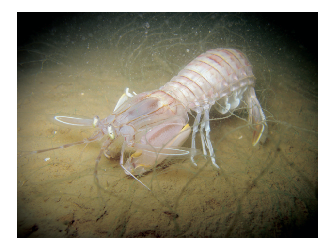
Fig. 2: Would the populations of some edible crustaceans face a decline due to higher temperatures and oxygen depletion in the bottom layer?

The scenario for sea bass is similar to that for the flat oyster. The dangerous or lethal temperature for the flat oyster is 26 °C, which has already been measured along