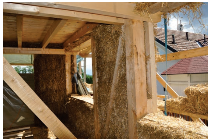
Slika 4: Lesen skelet s polnilom iz bal slame.

Respondents evaluated straw bale building based on five basic attributes of building: economic, ecological, health, aesthetic and functional aspects. In an attempt to put into perspective the relevance and importance of straw bale building, participants of the survey were asked to subjectively compare and contrast and thereby rank the order of importance of these attributes for their building. Each attribute was given grades between 1 (not important) and 5 (extremely important). Within the questionnaire, respondents also had an opportunity to share and