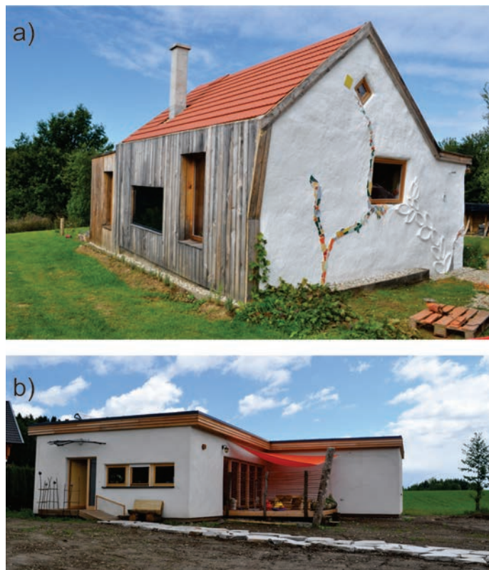
Slika 3: Hiši iz bal slame v Šulincih (a) in Celovcu (b). Figure 3: Straw bale house in Šulinci (a) and in Celovec (b).