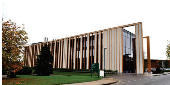
Slika 1: Vstopni objekt, Nottinghamska univerza, VB.

The choice of basic building materials is an important part of each project and is usually based on professional judgment, taking into consideration the importance of various criteria such as economic, environmental, functional, aesthetic and health aspects. The priority varies depending on the needs, desires and abilities of each user/investor usually in agreement with the designer. Choice of basic building material is also based on consideration of many other factors and its properties. In this paper the most evident properties of straw bales as advantages and disadvantages.