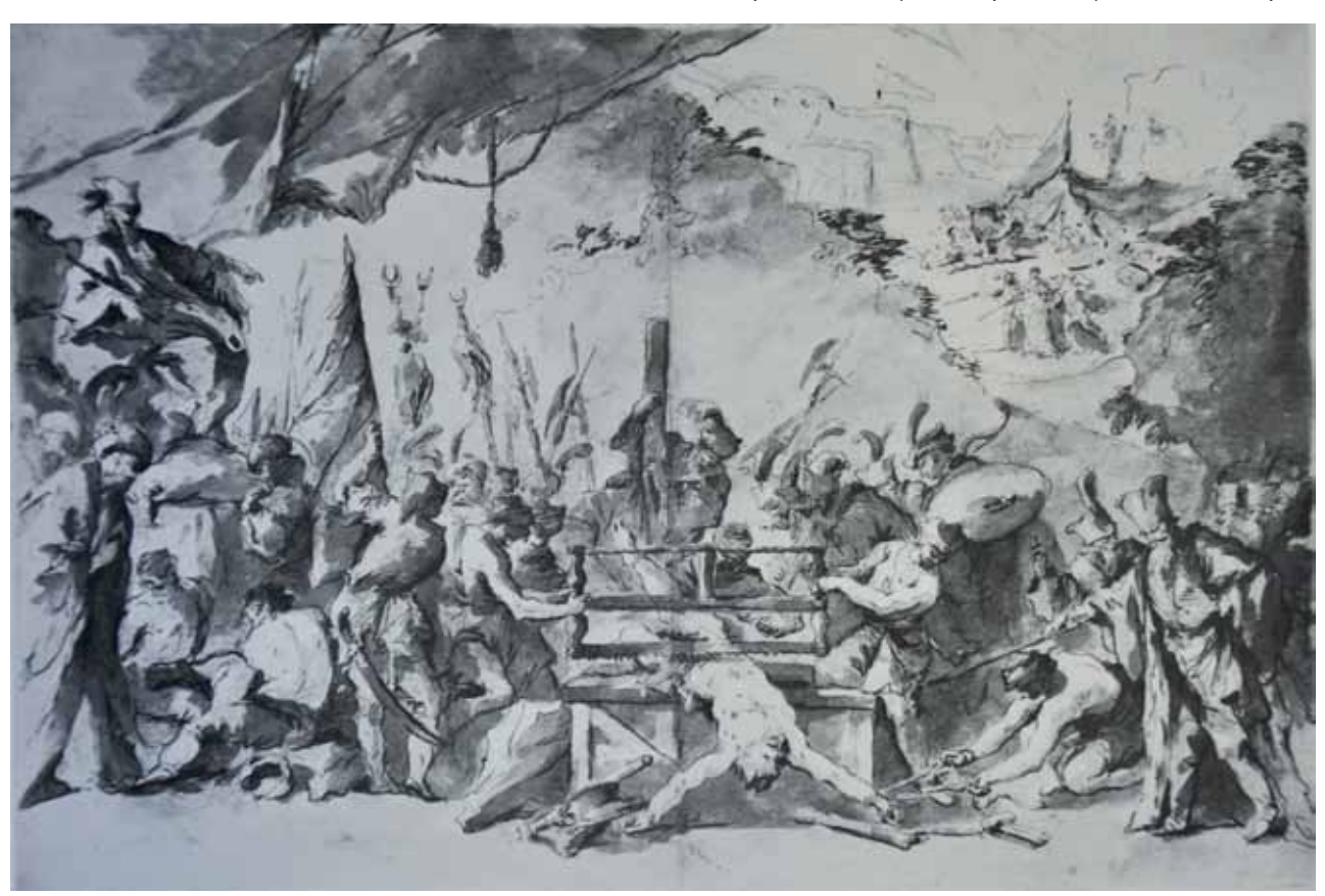
Fig. 4: Antonio Guardi: Martyrdom of Paolo Erizzo, Collection Vittorio Cini (Morassi, 1975, 96). Sl. 4: Antonio Guardi: Mučeništvo Paola Erizza, Zbirka Vittorio Cini (Morassi, 1975, 96).

and to the right Paolo Erizzo in front of Sultan Mehmed II who sentences him to death. All three main images depict the story of Paolo and are based on the short passage in Sagredo's book: "L'Erizo doppo hauer difeso per quanto gli fù permesso il di fuori, & il di dentro della Piazza, si fece forte sostenendo per qualche spatio di tempo le rouine della Città. Mà mancata la monitione da viuere, e da Guerra si rese al vincitore salua la testa. I Turchi al solito crudeli, secatolo per lo mezzo, pretesero d' hauer promesso di perdonare alla testa, mà non al busto." (Sagredo, 1673, 111-112). To the left, the armoured Paolo Erizzo steps proudly from the ruins of the fortress towards the fighting Ottomans. The streets of Negroponte are covered in dead bodies, probably also illustrating Sagredo, who describes extensively the 'cruelty of the inexorable Barbarian' after the fall of Negroponte (Sagredo, 1673, 112). In the scene on the right, the still armoured but chained Paolo Erizzo stands in front of Mehmed, who is sitting in an elaborate tent. The artist was familiar with the contemporary attire of bailos, since Paolo Erizzo wears the same kind of headdress as those in which Venetian bailos to Constantinople were portrayed; for example, Giovanni Emo by Pietro Umberti in Museo Correr in Venice (Koch, 1996, 345). The central scene depicting Paolo's martyrdom corresponds exactly to the previously mentioned sopra-