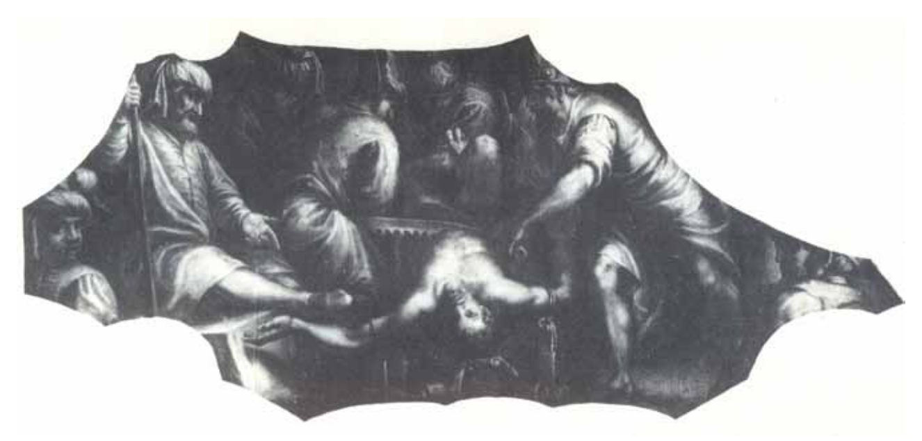
Fig. 6: Francesco Montemezzano: Martyrdom of Armario Albano (later interpreted as Martyrdom of Paolo Erizzo), Hall of the Great Council, Palazzo Ducale, Venice (Mantovanelli, 1989, 69). Sl. 6: Francesco Montemezzano: Mučeništvo Armaria Albana (kasneje interpretirano kot Mučeništvo Paola Erizza), Dvorana Velikega sveta, Doževa palača, Benetke (Mantovanelli, 1989, 69).