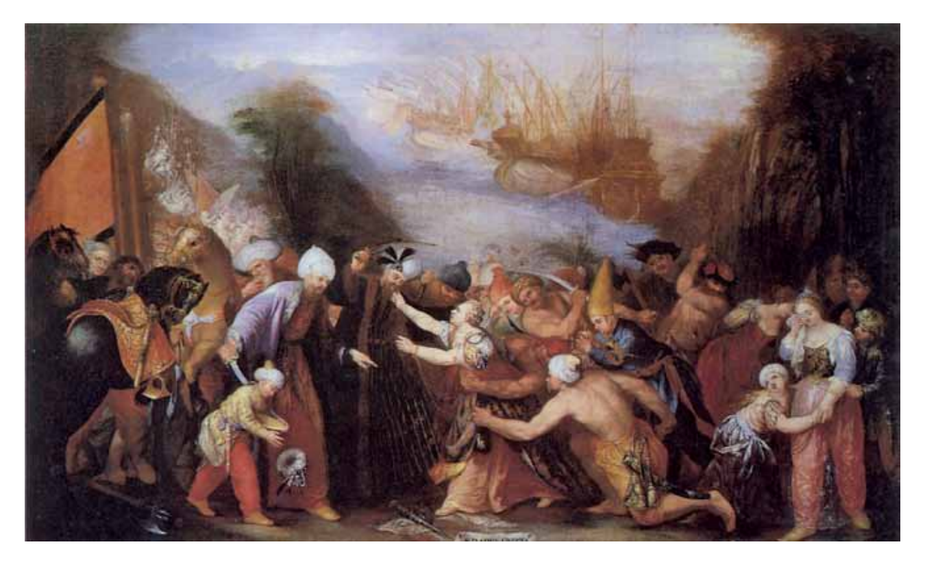
Fig. 2: Andrea Celesti: Death of Anna Erizzo, private collection (Pilo, 2000, 110). Sl. 2: Andrea Celesti: Smrt Anne Erizzo, zasebna zbirka (Pilo, 2000, 110).