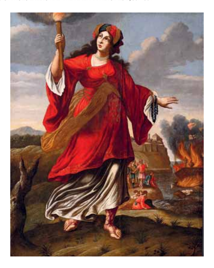
Fig. 13: Franz Steinpichler (?): The Cypriot lady, Ptuj Regional Museum (Vidmar, 2005, 99). Sl. 13: Franz Steinpichler (?): Ciprska dama, Pokrajinski muzej Ptuj (Vidmar, 2005, 99).

Le Moyne's book is illustrated with a frontispiece and twenty copper engravings with etched background scenes depicting the heroines. The engravings with heroines were executed by Abraham Bosse and Gilles Rousselet after the inventions of Claude Vignon (Pacht Bassani, 1992, 437-447; Baumgärtel, 1995, 170; Lothe, 2008). The heroines are depicted prominently, occupying the foreground; while the scenes of their heroic acts are depicted on a much smaller scale in the background. Each depiction carries an inscription with a short description of the virtuous act. On page 326 of Le Moyne's book we find "Vne Dame de Chipre, met le feu aux Galeres des Turcs chargées du butin de Nicosie, et par la hardiesse de sa mort deffuit vne Armée victorieuse; et venge le sac et la seruitude de sa Patrie." The Cypriot lady is depicted with a burning torch in her right hand and broken chains on her left wrist. In the background, on the right-hand side, are the fortified walls of Nicosia and the burning ships in its harbour. Lala Mustafa Pasha and his soldiers as well as the