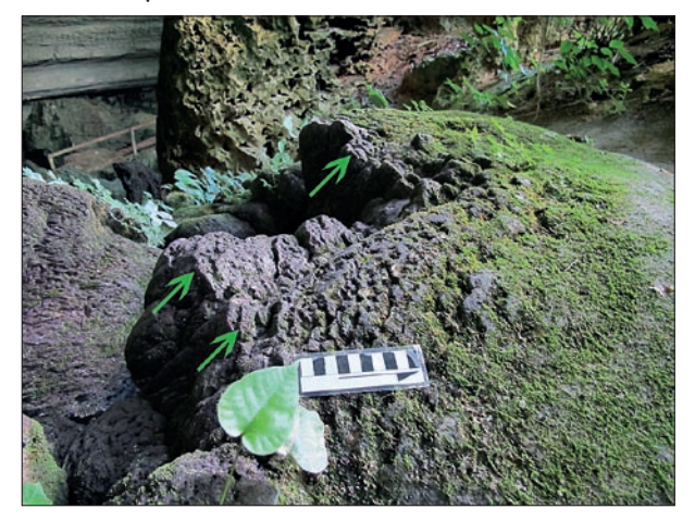
Fig. 5: Curved inclined rims running across stalagmite in Traders Cave in Niah (shown by arrows) and smaller irregular rims near scale bar (in cm). Camera is approximately horizontal. Light measurement station TCS2A is at first arrow from the left and station TCS2B is at third arrow from the left.

the rest of the surface and it is thought that, in that case, they are the site of maximum abiotic calcite deposition and minimal biological influence (Fig. 4). In other stalagmites the summit is not recessed. It may be flat and patterned with micro-rims (forming tiny gours) similar to those observed on abiotic speleothems and flowstones, or relatively smooth.