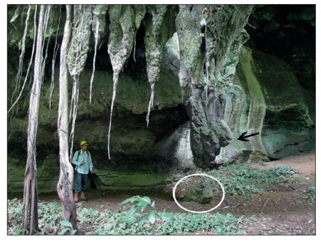
Fig. 3: Entrance to Painted Cave in Niah (lower passage). Note large bulbous tufaceous stalactites (arrow) and biologically influenced stalagmite (circled) on muddy sediment floor.

The number of stalagmites listed above may be affected by sampling bias as more field time has been devoted to the more readily accessible entrances of select-