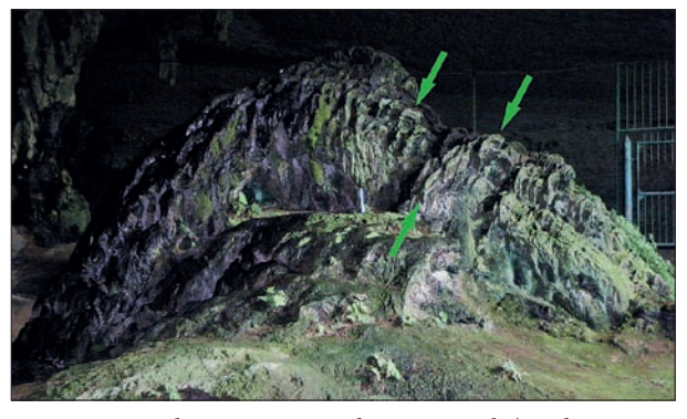
Fig. 6: Large stalagmite in Painted Cave in Niah (north entrance, upper passage) showing well developed large inclined phototropic rims (arrows). Rim concavity faces the source of natural light (entrance to the right side of photo, below the stalagmite). Ruler in centre of photo is 15cm long. Natural light.

The most characteristic features of crayback stalagmites are the crenulations which give them a stepped profile. The crenulations are due to scale-like features oriented towards the light. Some, but not all, of the stalagmites described here have this type of crenulations on their upper surface (including the crayback described by