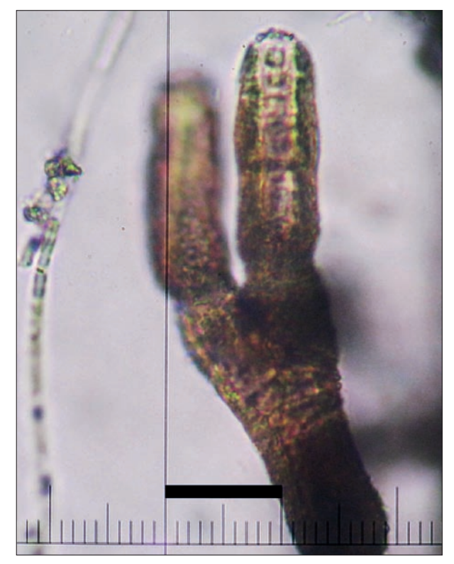
Fig. 8: Calcified filamentous cyanobacteria from the stalagmite circled in Fig. 3 (Painted Cave in Niah, lower entrance). The dichotomously branching calcified cyanobacteria are possibly Geitleria calcarea. Thick black scale bar is 25 microns long.

Two of the stalagmites have an additional feature of interest - oriented coralloid growths pointing to the entrance on their entrance-facing sides and front. These two stalagmites are both located in the Gan Kira passage of Niah Great Cave approximately 60m in from the entrance dripline (Fig. 1B). This location is the darkest of the observed stalagmite locations. It is also a location with noticeable cave wind.