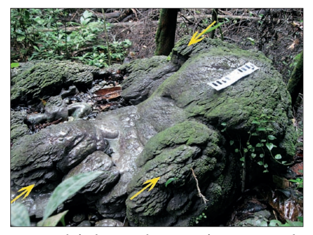
Fig. 4: Detail of stalagmite at the entrance of Racer Cave in Mulu. Note smooth wet zone, slightly recessed (near scale bar), small pool to left of centre and crenulations oriented towards the light (arrows). Scale bar is in cm.

However, many of the stalagmites differ, slightly or considerably, from the typical elongated and humpbacked crayback morphology. Some are not elongated but irregularly massive (Fig. 4, Fig. 5 and Fig. 6) others are bulbous (Fig. 7) or have bulbous protuberances, whereas others are flat topped. In fact their morphology is best described as "variable". The bulbous protuberances, where present, resemble the common bulbous features of tufaceous stalactites (Fig. 3). The bulbous aspect of the stalagmites is not unlike that seen in parts of some tufa waterfalls elsewhere in the world.