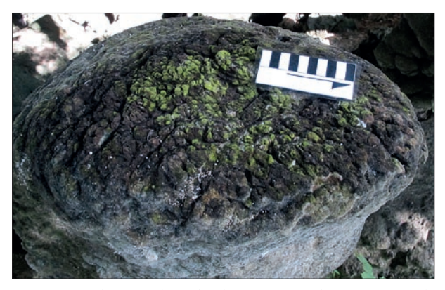
Fig. 7: Convoluted surface of stalagmite in Traders Cave in Niah. The stalagmite is slightly elongated (parallel to photograph) and parts of the top are currently colonized by mosses. Scale bar is in cm with arrow pointing to cave exterior.

In places the surfaces of some of the stalagmites have a crinkled convoluted aspect (Fig. 7). The surfaces are marked by short irregular curved grooves and rounded ridges similar to the surface of the brain or brain corals. The convolutions, grooves and ridges do not show preferential orientation relative to light.