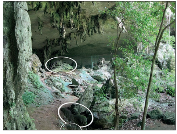
Fig. 2: North entrance of Painted Cave in Niah (upper passage) showing location of biologically influenced stalagmites (some indicated with circles). Fenced area in background is zone with cave wall paintings.

Mulu - Racer Cave : 2 specimens (incomplete survey) in northwest facing entrance