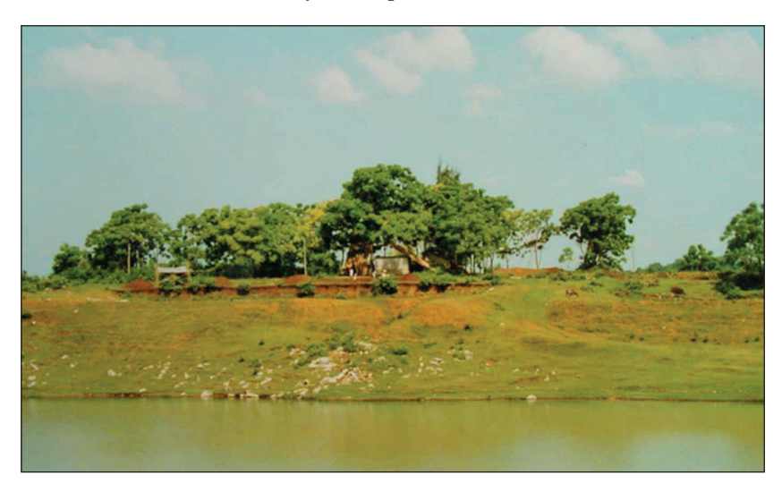
Fig. 2. The Dingsishan site (Courtesy of the Guangxi Team of the Institute of Archaeology of the Chinese Academy of Social Sciences).

Although cobble tools dominate the stone industry in prehistoric South China, small stone flakes produced by direct percussion with a hard hammer have