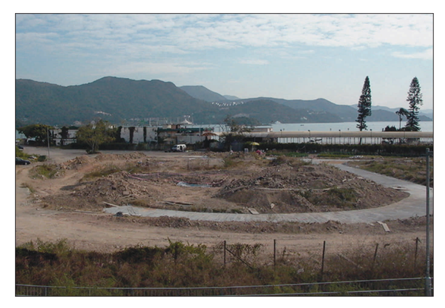
Fig. 3. The Sha Ha site in Hong Kong.

also been found at the Bailiandong and Liyuzui sites in Guangxi, dated to approximately between 20 000 and 10 000 bp, and the majority of flakes are chert (Tab. 1) (Fu 2004; Jiao 1994; Wang 1997). It is claimed that some small flakes found in Bailiandong might have been made by press flaking (Jiang 2009. 118). As no use-wear analysis has been conducted on these flakes, their functions remain unknown, but they apparently differ morphologically and technically from the microblades produced by indirect percussion and/or press flak-