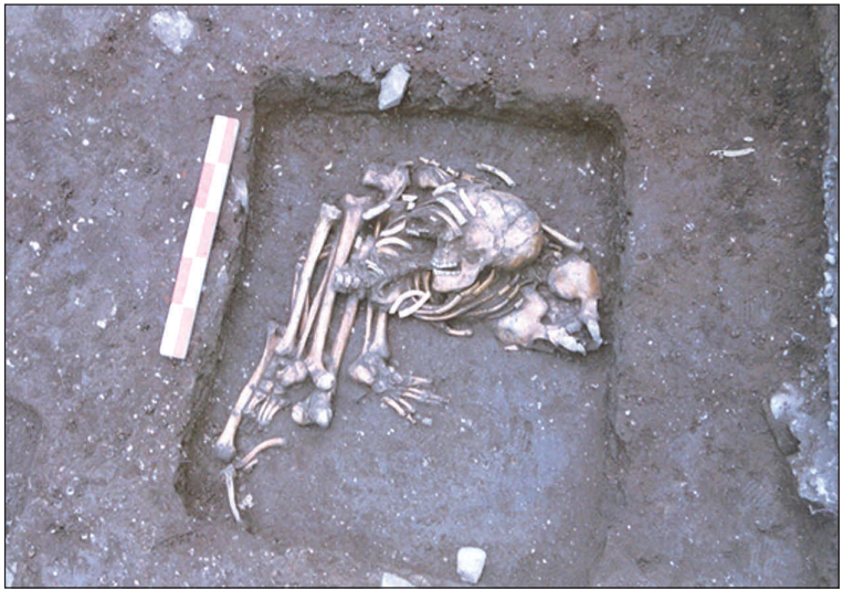
Fig. 4. Disarticulated burial at Dingsishan (Courtesy of the Guangxi Team of the Institute of Archaeology CASS).

As I have suggested, the early farmers of South China might have been migrants from the Yangzi River Valley, or local groups receiving cultural influences from their neighbours to the north, as indicated by the similarity of pottery found in Xiaojin and Shixia in northern South China. However, the majority of people in South China between 6500 and 3500 bp, particularly in the Pearl River Delta, remained foragers. Full reports of the archaeological sites in the Pearl River Delta are not available, but large amounts of shells and