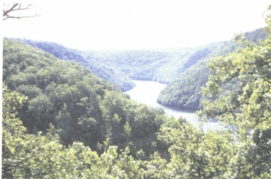
Eastern part of Podyjí National Park. Canyon-like valley of Thaya river with Dam of Znojmo.