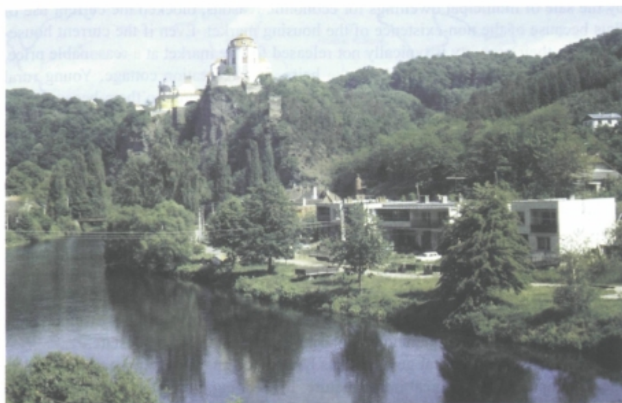
Barock castle in the Vranov nad Dyjí is situated above the near-vertical gneissic walls of the deep valley of Thaya river.