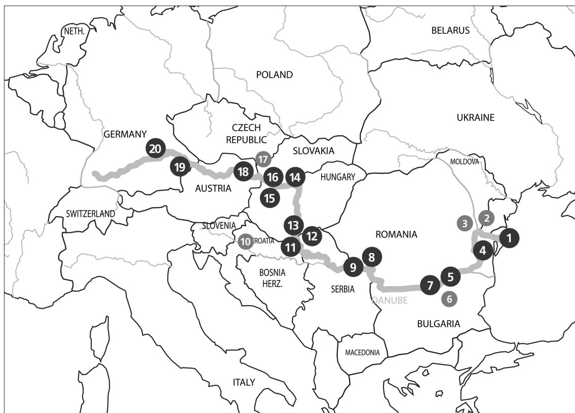
Figure 2 / Slika 2: Distribution of protected areas within the DANUBEPARKS network. Data gathered from the following areas (dark grey) were incorporated in the analysis: / Lega zašćenih območij v omrežju DANUBEPARKS. Podatki z naslednjih območij (temno siva) so vključeni v analizo: Danube Delta Biosphere Reserve (1), Small Wetlands of Braila (4), Kalimok-Brushlen Protected Site (5), Persina Nature Park (7), Iron Gates Nature Park (8), Đerdap National Park (9), Kopački rit Nature Park (11), Gornje Podunavlje Special Nature Reserve (12), Danube-Drava National Park (13), Danube-Ipoly National Park (14), Fertő-Hátság National Park (15), Dunajské Luhy Protected Landscape Area (16), Donau-Auen National Park (18), Narrow Valley of the Danube near Passau (19), Danube riparian forest Neuburg-Ingolstadt (20). Additionally, protected areas along tributary rivers (light grey) were surveyed in the census, but their counts are not included as they are not located along the Danube: / Zašćenena območja vzdolž pritokov (svetlo siva) so bila del popisa, vendar njihovi podatki v analizo niso vključeni, saj ne ležijo vzdolž Donave: Lower Prut Nature Reserve (2), Lower Prut Floodplain Natural Park (3), Rusenski lom Nature Park (6), Lonjsko polje Nature Park (10), Záhorie Protected Landscape Area (17).