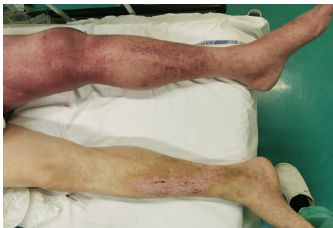
Figure 1. Patient's legs upon the first examination.