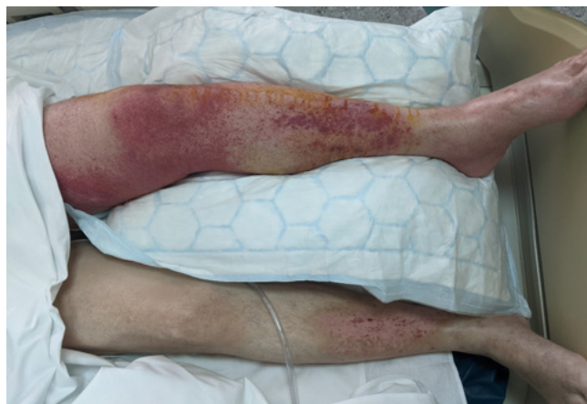
Figure 2. Patient's legs after successful reperfusion.