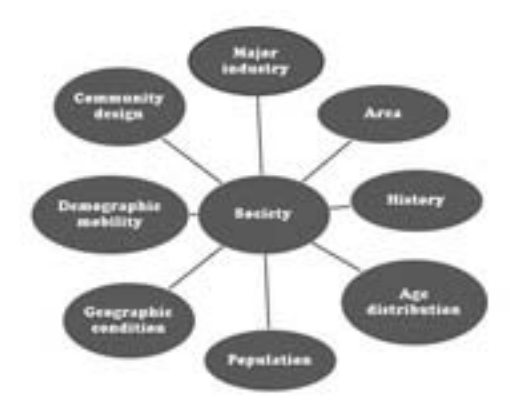
Figure 3 Composite of factors in the structure of society

The structure of the society itself can be described in Figure 3. As shown in Figure 3, a number of factors do exist as components of the society. The social meanings of each factor show differences in their nature.