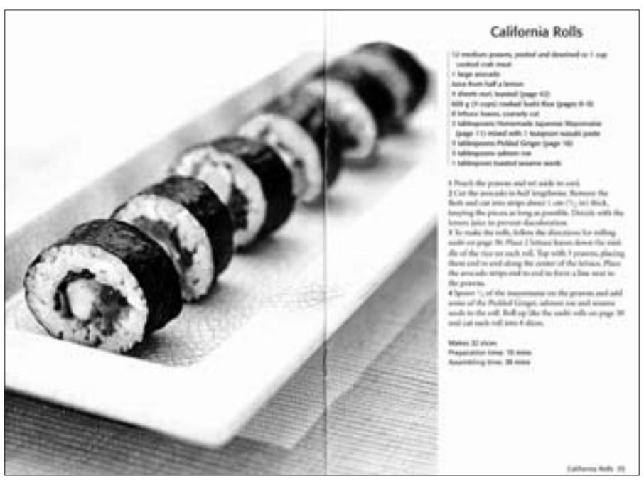
Figure 1 Ingredients of Japanese dish, sushi, in a 'cookbook' (Donald 2003, 34–35)