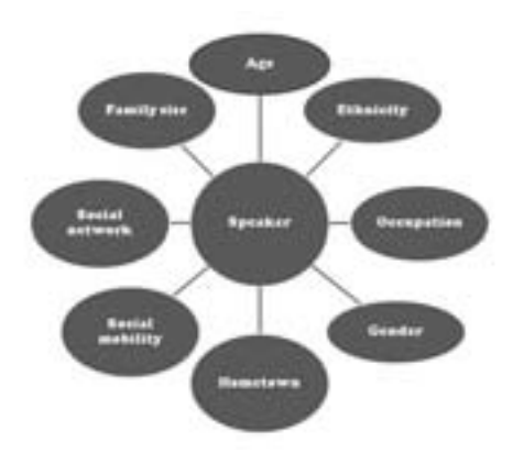
Figure 2 Composite of social variables in a speaker

Figure 2 consists of possible social variables which compose a speaker. The entity of the speaker itself includes all possible social variables whose social meanings and social assessments differ from one another.