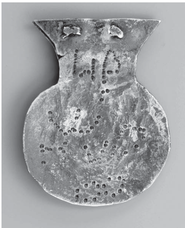
Fig. 2: Strap end with incised points. Kept in the National Museum of Slovenia.

strap end from the second half of the 4 th century (around the year 400) found in the river Ljubljanica. The name Antiohos was engraved in Greek letters on its front side in the second case (Antiohou). 4 It is known that many Greeks who moved from the East to Rome or just to the West never learnt properly how to cope with the Latin alphabet and hence they used their own to write Latin. 5 That could also be the case with the name Antiohos since we are dealing with the soldier who could have come from the Eastern part of the Empire.