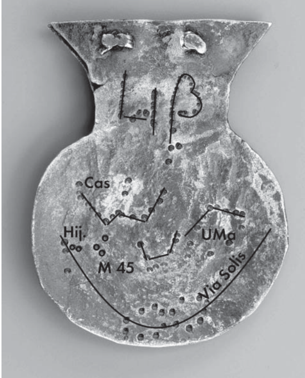
Fig. 4: Possible constellations on the strap end (Cas – Cassiopeia; UMa – Big Bear; M 45 – Pleiades; Hij – Hyades; Via Solis).

of the sky, which he could use to tell (or measure) time or to define his location - in such a case we could be dealing with a simple astrolabe. 18 If we take into consideration that the Pleiades were used in Antiquity in navigation, this becomes even more probable. 19