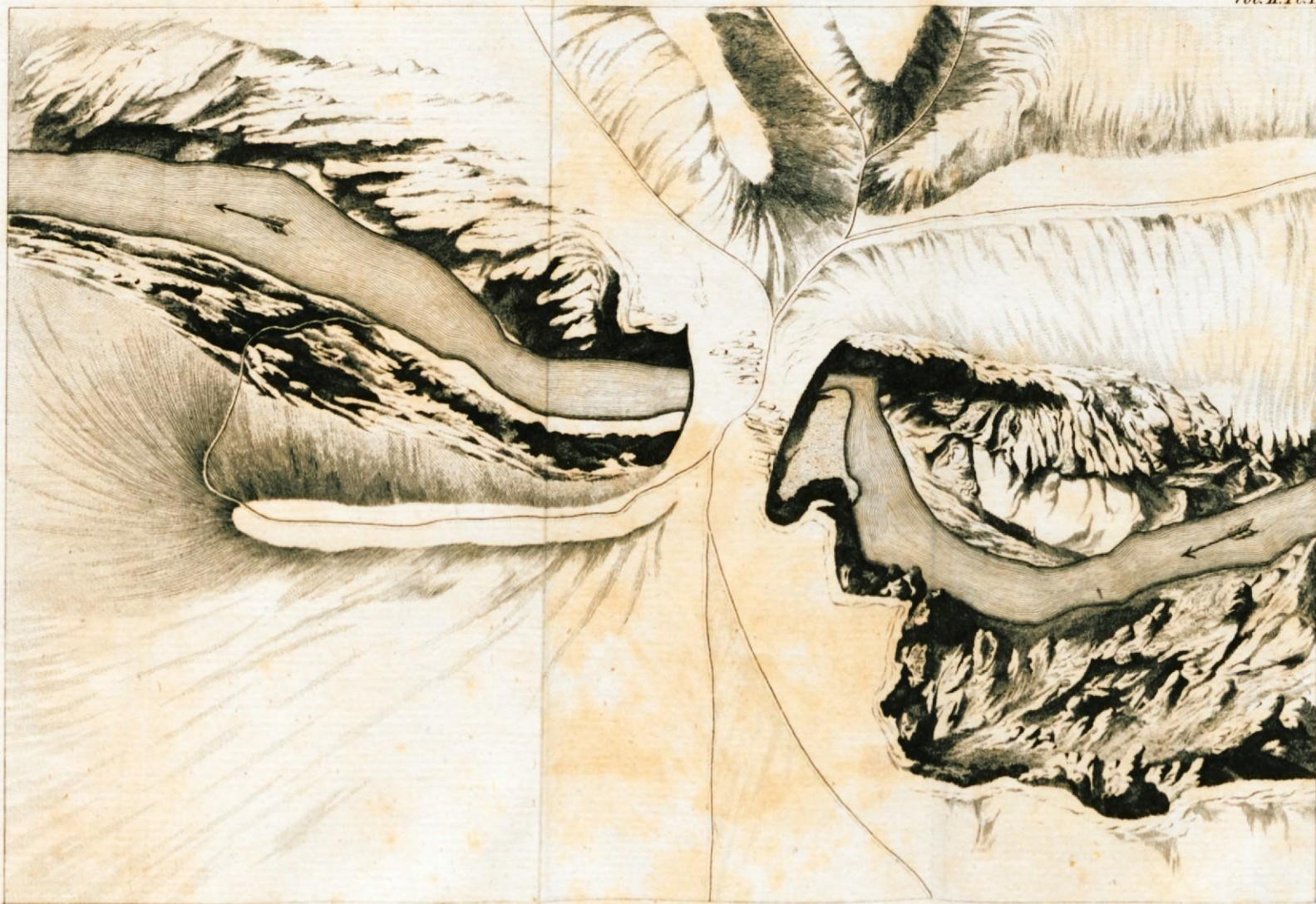
GEOMETRICAL PLAN of the NATURAL BRIDGE.