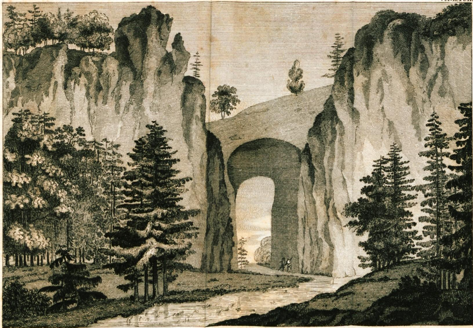
PERSPECTIVE Taken from POINT A.