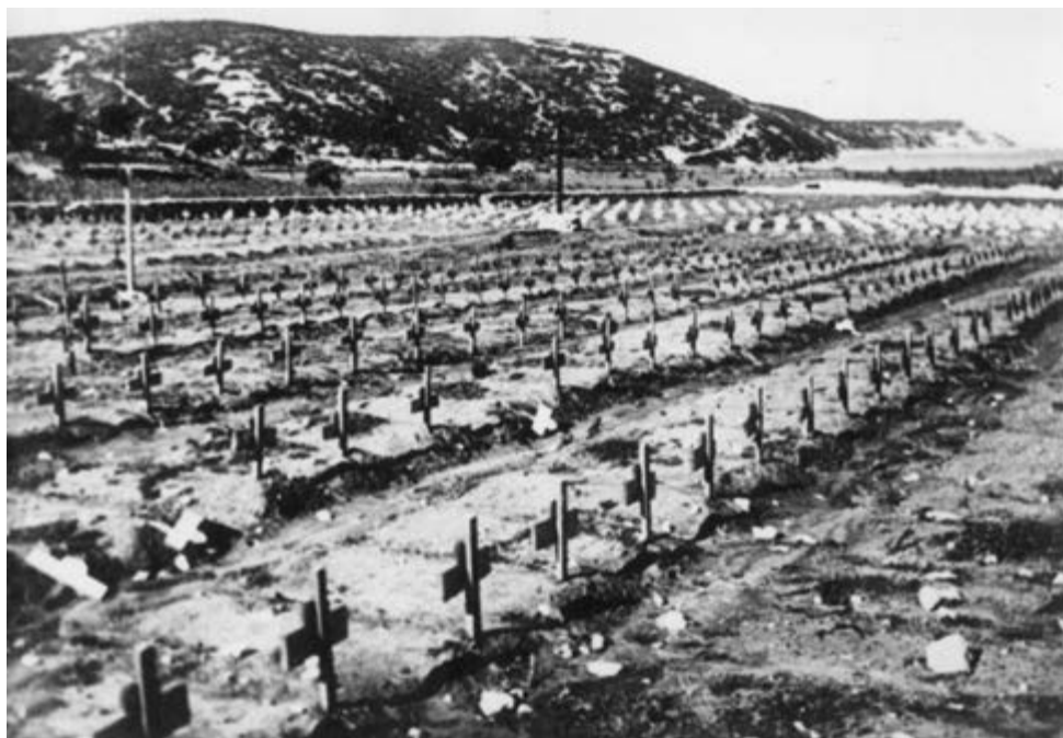
Figure 3. Cemetery for the inmates of the concentration camp Rab in 1943.