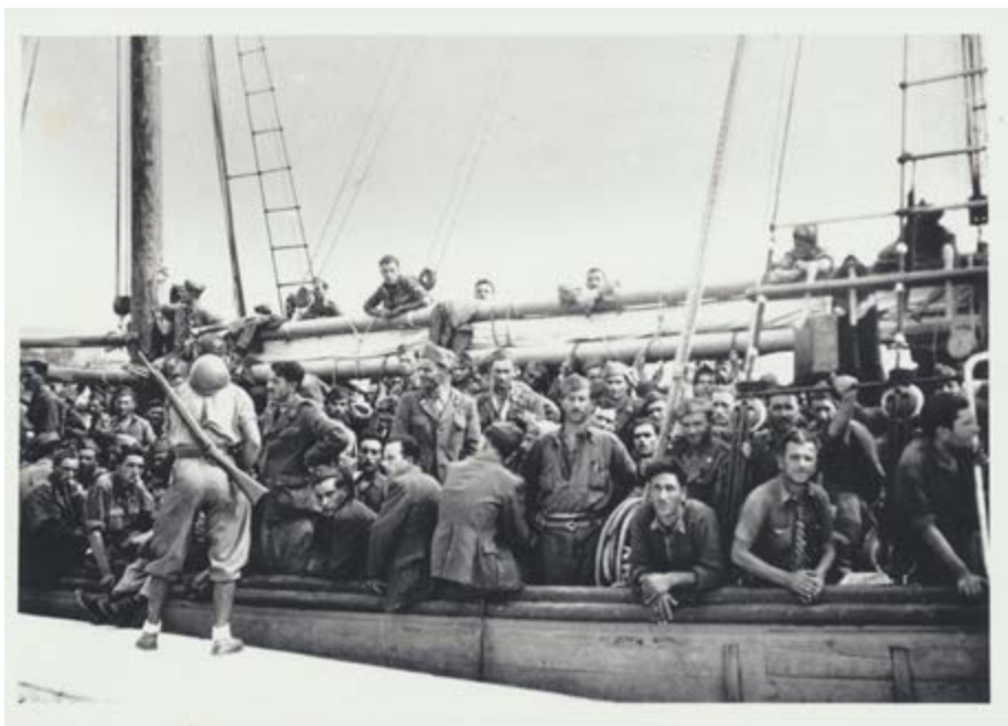
Figure 1. Disarmed Italian soldiers leaving the island of Rab, September 1943.