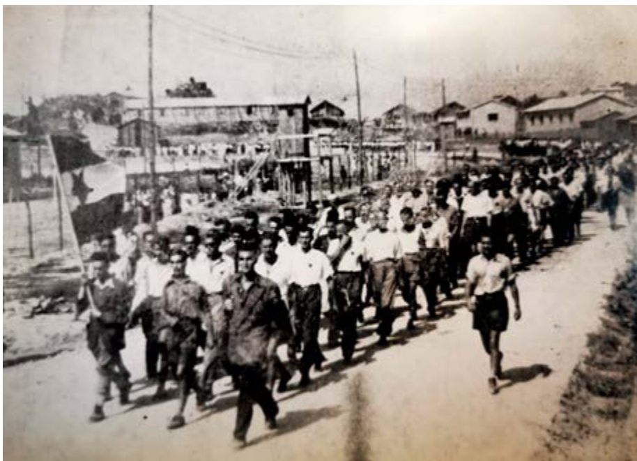
Figure 2. Jewish Fifth Battalion of the Rab Brigade on march, September 1943 (published by Jaša Romano in 1973).