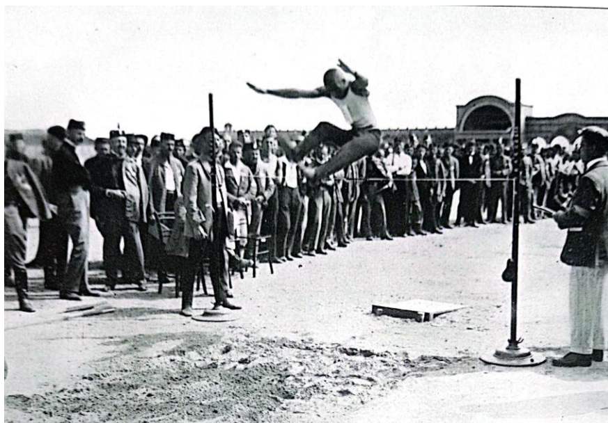
High jump technique at the 1922 World Championships

(in 1920 at OG Olympic champion Charley Paddock, USA won with 10.8 s)