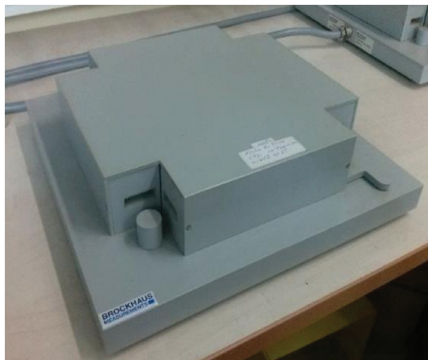
Figure 5: Epstein tester for measurements of magnetic properties of soft-magnetic silicon steels 9