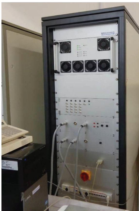
Figure 4: Instrument for measurements of magnetic properties of soft-magnetic silicon steels 9 – MPG 200D Brockhaus Messtechnik

A necessary condition for obtaining high-quality electrical steel is a minimal amount of magnetic ag-