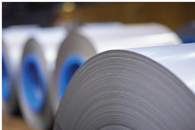
Figure 1: Coils of soft-magnetic Fe-Si-Al steel (SIWATT brand of SIJ Acroni d.o.o., Jesenice, Slovenia) 9

The accumulation of impurities in the recycling of steel impacts the quality of secondary steel. Understanding impurity levels is crucial in the context of the proliferation of circular-economy policies, expected high recycling rates, and the growth of scrap consumption. 10 The complexity of the materials' behaviour, and consequently, the metallurgical processing of silicon steels for magnetic applications increases with the complexity of steels' chemical composition. Si being a ferrite stabilizer increases the ferrite phase fraction of Fe. 11 The addition of Si to iron brings notable changes in the physical, mechanical and magnetic properties of the Fe. The most notable effect regards the electrical resistivity. Alloying with Al instead of Si leads to similar physical and structural effects, while not causing material embrittlement. However, Al is very reactive and prone to oxide formation, but it brings an increase in magnetostriction. 5 When circular-economy approaches are involved, i.e., secondary-metallurgy routes, the steel's cleanliness becomes an important factor for silicon steels that are to be further processed into grain-oriented or non-oriented electrical steel sheets and coils. In the electric-arc-furnace (EAF) steelmaking process, the main raw material is ferrous scrap, and an inspection of its quality is the first crucial step in producing clean steel. Ferrous scrap is the most recycled material in the world, and through its utiliza-