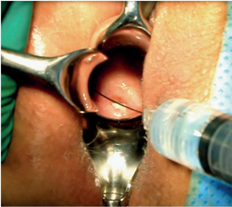
FIGURE 1. Para-cervical injection of anaesthetic prior to the pre-planning insertion of the intracavitary applicator.

Accurate applicator insertion with optimal geometric distribution of eventual IS channels is a precondition for the tight control and fine-tuning of the dose distribution. The inadequacies of a sub-optimal application cannot always be compensated by treatment plan optimization. Applicator insertion geometry is typically based on clinical and MRI findings at diagnosis and clinical findings at IGABT. 1,22 Planning MRI is performed only after the insertion, limiting the ability for corrections in case of suboptimal implantation. In such cases, the inadequacies from the first procedure should be taken into account during eventual subsequent insertion(s), improving the cumulative dosimetric outcome.