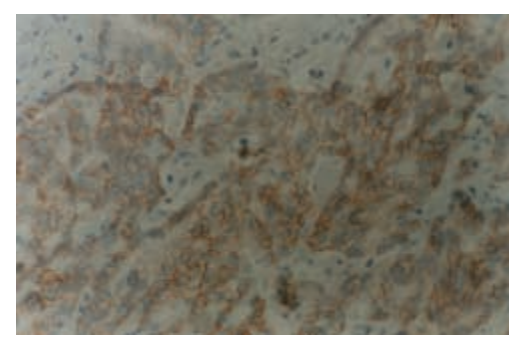
Figure 1. Positive immunostaining of HER-2 in pulmonary adenocarcinoma (DAKO Hercep Test ^{TM} ).

There was no statistically significant difference given the age and gender.