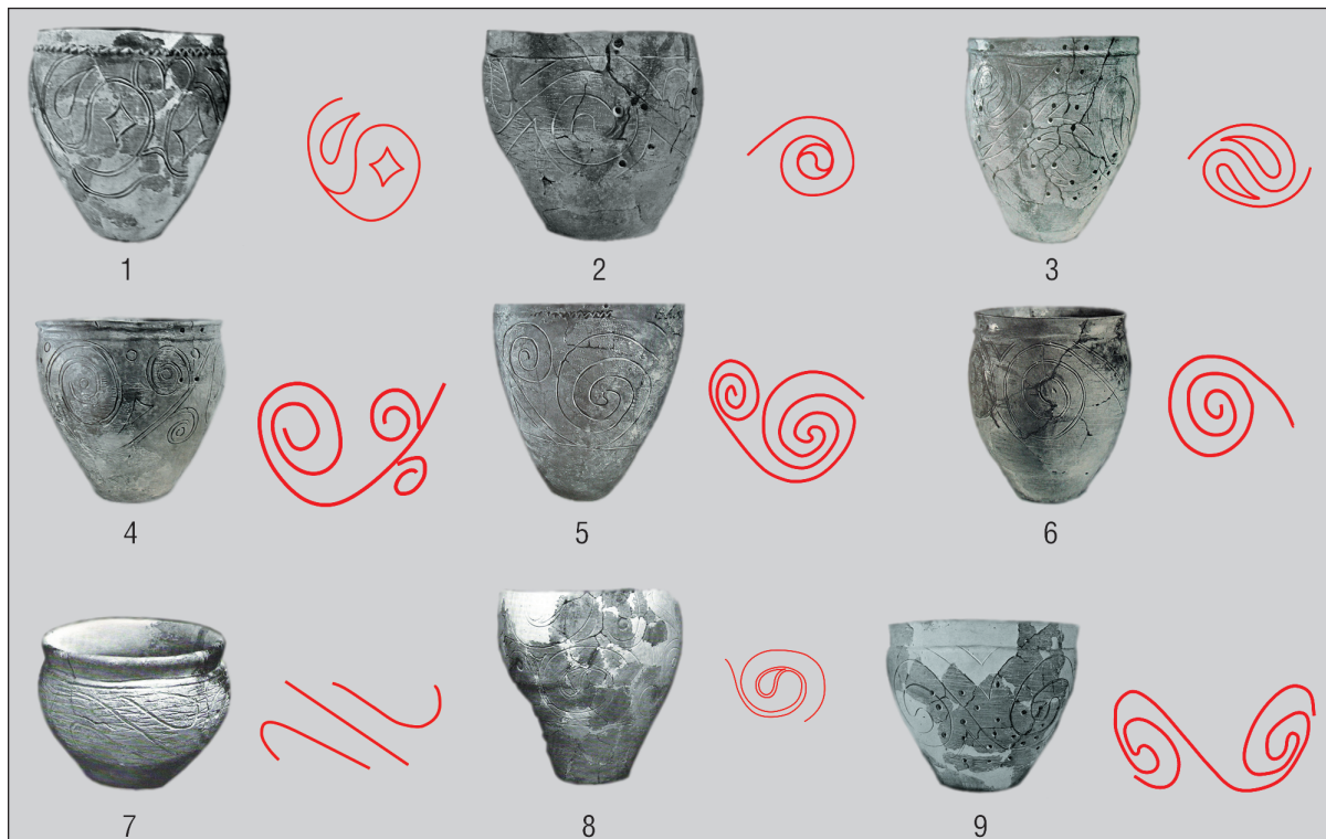
Fig. 11. Spiral patterns on Voznesenovka culture pottery, Lower Amur region (1–6, 8, 9 – from Okladnikov 1984.Tabl. XV, XIX, XX, XXI, XXII, XLV, XLVI, LVII; 7 – from Okladnikov 1981.Pl. 91)