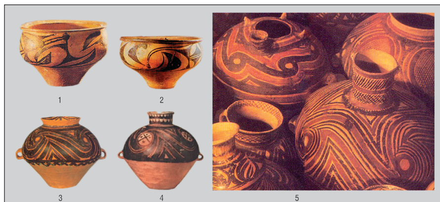
Fig. 8. Spiral patterns on Yangshao pottery, East China (1, 2 – from Kuchera 1977.Pl. 2, 3; 3, 4 – from ( http://www.bibliotekar.ru/china1/3.htm )).

formed with left-oriented Archimedes spirals is found on the pottery of Machayao culture (Skarpari 2003. 155).