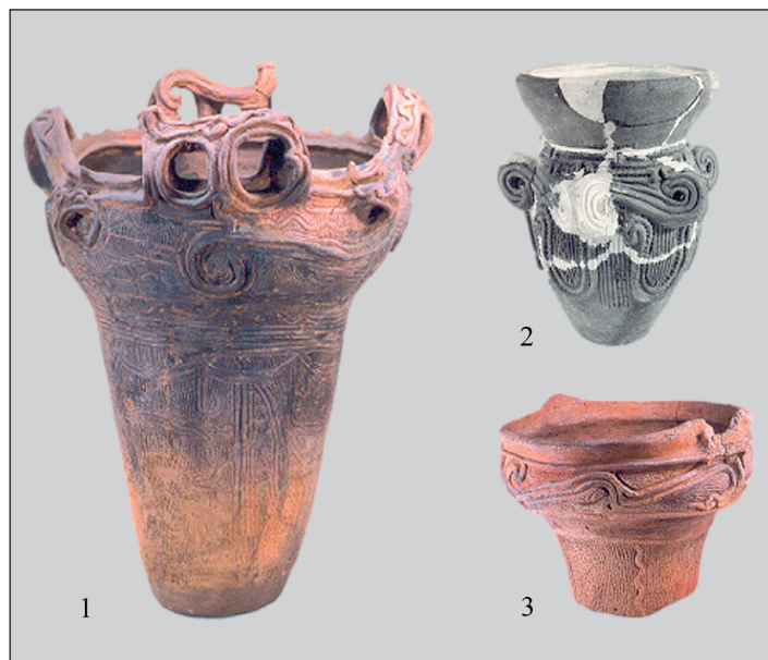
Fig. 5. Spiral patterns on Middle Jomon pottery, Japanese archipelago (1, 3 - from Kobayashi 2004.43; 2 - Yamanouchi 1964.Pl. 139).

164–182; Kobayashi 2004.40, 42–49; Pearson 1992. 73–75).