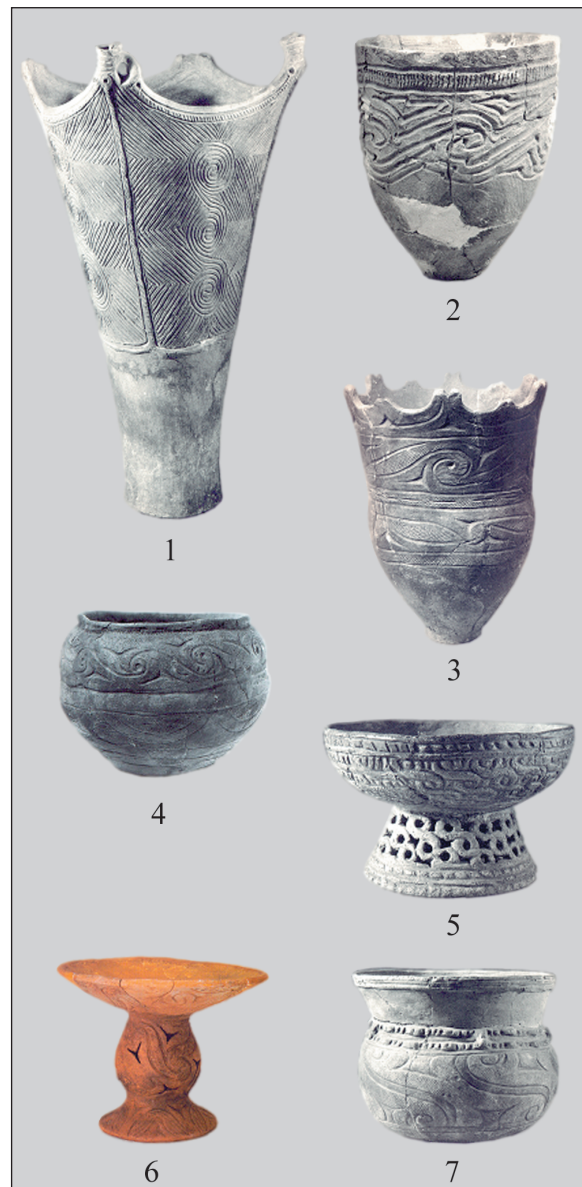
Fig. 7. Spiral patterns on Late and Final Jomon pottery, Japanese archipelago (1, 2, 3, 5, 7 – from Yamanouchi 1964.Pl. 181, 209, 235, 244, 250; 4 – Catalogue 1999.33; 6 – Kobayashi 2004.40).

The ceramic vessels of the Machayao culture are decorated with wide polychromic horizontal bands constructed of combined clothoid spirals of ascending and descending type (Fig. 9.1–4). An interesting case is the ornamental band formed by four descending clothoid figures combined with stylized frog images (Kashina 1977.117, Fig. 53 – 9a, 9b). In some cases, one can note a net-structured pattern of circles and ascending clothoid spirals (Fig. 9. 5) (Kashina 1977.113, Fig. 50–1). A specific feature of clothoid spiral patterns on Machayao and Yangshao pot-