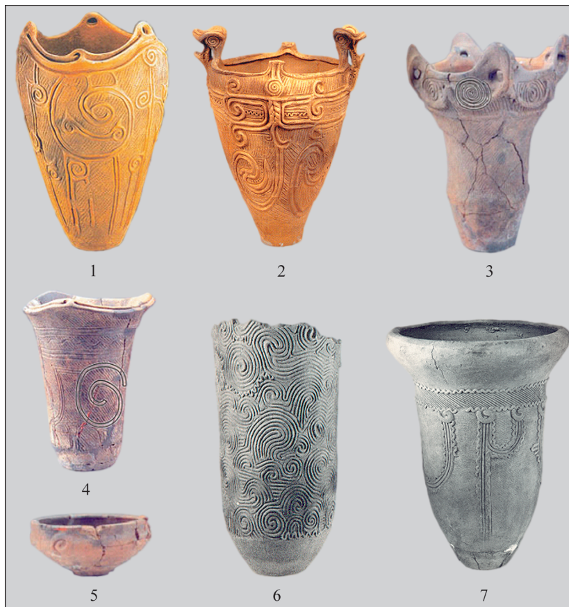
Fig. 4. Spiral patterns on Middle Jomon pottery, Japanese archipelago (1, 2 - from Kobayashi 2004.44, 46; 3, 4, 5 - Catalogue 1999.11; 6, 7 - Yamanouchi 1964.Pl. 122, 112).

position of ornamental motifs and elements was known in the pottery-making tradition of the Early Jomon period. For instance, ceramic vessels of Ento type were designed with vertical zones filled in cord impressions of various kinds (Yamanouchi 1964.Pl. 32, 33). Obviously, the manner of orienting ornamental patterns vertically survived during the Middle Jomon period, but in another decorative context. Interesting cases are the compositions formed by combining large and small Archimedes or logarithmic spiral figures (Fig. 4. 1, 2).