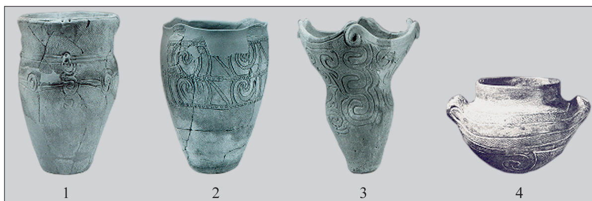
Fig. 6. Spiral patterns on Late and Final Jomon pottery, Japanese archipelago (1, 2, 3 – from Catalogue 1999.29, 31, 47; 4 – Yamanouchi 1964. Pl. 202).

The Yangshao culture was discovered in the Huanghe River basin in the 1920s. The investigation of archaeological sites abundant in various cultural remains provided information of great value for understanding the Neolithic of East and Central China. The pottery was recognized as the most remarkable feature of Yangshao culture. A developed technology, significant morphological diversity and surprisingly colorful and complicated decoration are distinctive features of Yangshao ceramic vessels (Chen Chunhe et al. 1995.25–35; Kashina 1977).