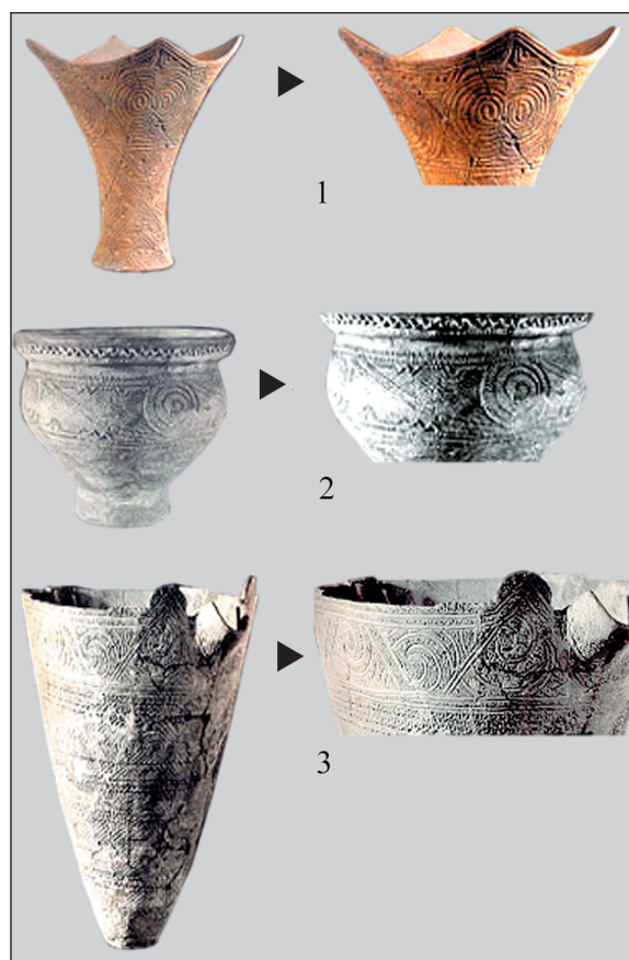
Fig. 3. Spiral patterns on Early Jomon pottery, Japanese archipelago (1 – Kobayashi 2004.38; 2, 3 – Yamanouchi 1964. Pl. 42, 43).

Spiral motifs developed further during the Middle Jomon period (3500-2500 BC) in local pottery styles called Kasory E, Kaen (Flame-like), Atamadai, Middle Daigi and others ( Aikens and Higuchi 1982.137-156; Kobayashi 2004.42-49; Yamanouchi 1964.Pl. 78, 79, 82-85 ). In general, these styles demonstrate great variability in decorative composition and technique. The decoration or ornamentation, including spiral motifs, were mainly produced by appliqué relief over a background of cord impressions. There are spirals of several types: Archimedes, logarithmic, and clothoid (Figs. 4 and 5). Given the data from publications, we can suppose that the Archimedes spiral occurs in pottery more frequently than other types (Fig. 4. 3, 4). A logarithmic spiral is identified clearly in some cases only (Fig. 4. 1). The series of pottery samples shows a figure which appears to be intermediate between Archimedes and logarithmic spirals, especially when the spiral is formed by 1.5-