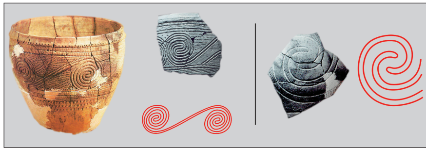
Fig. 10. Spiral patterns on Malyshevo culture pottery, Lower Amur region (from Okladnikov 1981.Pl. 62, 85, 89).

The pottery of Voznesenovka culture is quite interesting in some samples decorated with curvilinear anthropomorphic images. Fragments of such vessels were discovered at Voznesenovka (Fig. 12). An important element of this decoration is a spiral figure of yin-yang type. The decoration is produced by gro-