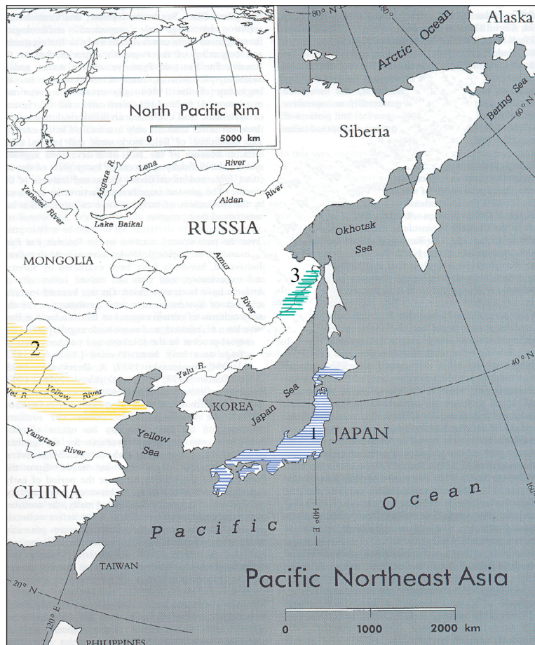
Fig. 1. Map of the research area: 1 – Japanese archipelago; 2 – East China, Huanghe River basin; 3 – Lower Amur River basin.

The Archimedes spiral was described by Archimedes in the 3 rd century BC. Its algebraic formula given in polar coordinates is: