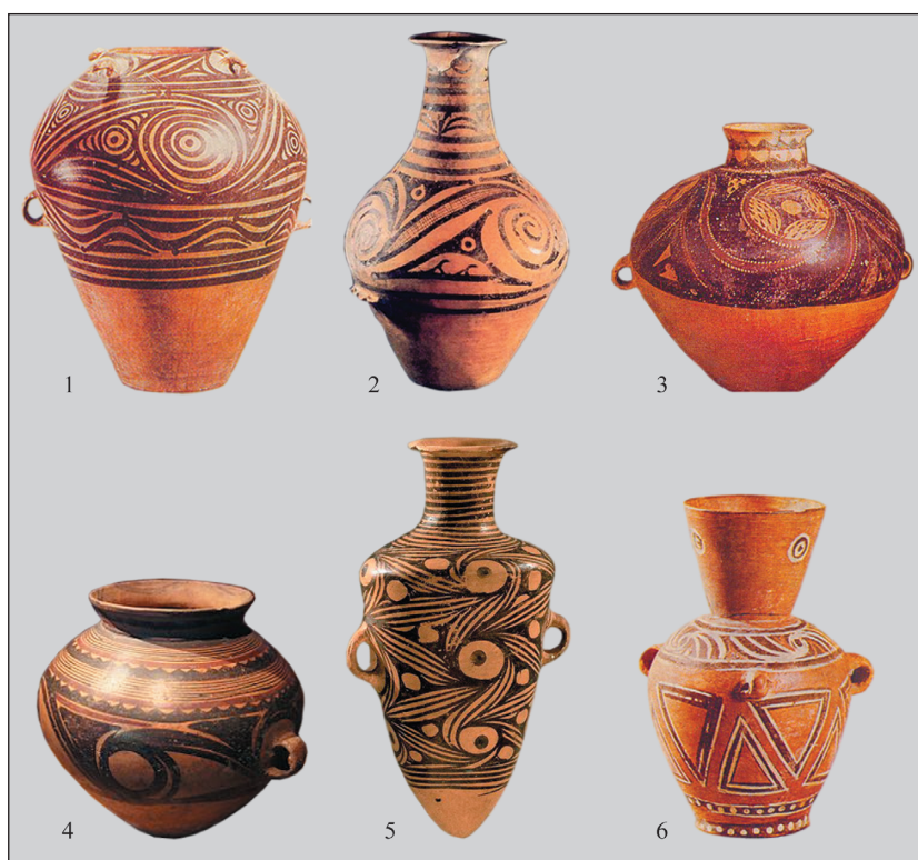
Fig. 9. Spiral patterns on Machayao (1–5) and Davenkou (6) pottery, East China (1, 3 – from Kuchera 1977.Pl. 4, 7; 2, 4, 5 – from http://www.bibliotekar.ru/china1/3.htm ; 6 – from Kuchera 1977.Pl. 11).

The pure flourishing of spiral patterns is connected with the pottery-making tradition of the late Neolithic Voznesenovka culture in the mid-3 rd –mid-2 nd mil BC. Ceramic vessels excavated at the sites at Voznesenovka, Kondon, Takhta, Suchu have horizontal band-like compositions formed with motifs of Archimedes and logarithmic spirals, clothoid spirals, and the yin-yang type, or a type of ‘T’ai Chi figure’ (Fig.