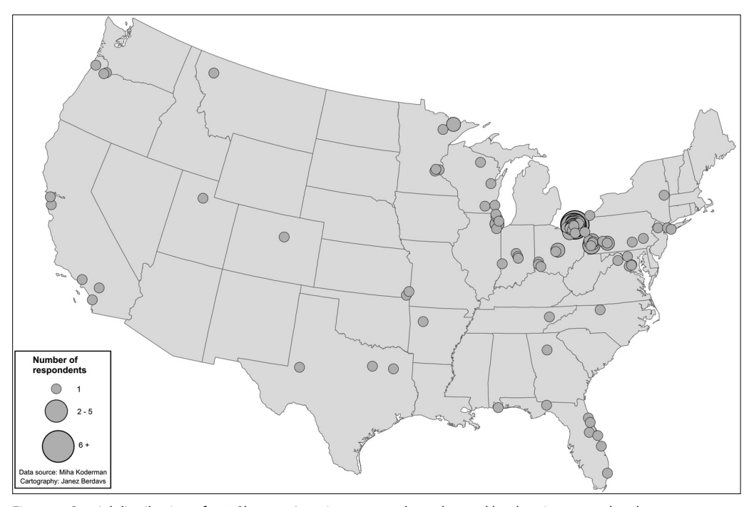
Figure 1: Spatial distribution of 150 Slovene-American respondents, located by the given postal codes.

Matjaž Klemenčič (2005: 113). The highest share of respondents came from Ohio (46 percent of total), of which 64 percent were from the Cleveland metropolitan area (including Euclid, Willoughby Hills, Mentor, Wickliffe, and Eastlake). Another 13 percent of the respondents came from Pennsylvania, with 8.5 of this 13 percent coming from the Pittsburgh metro area including Canonsburg and Coraopolis. Other states with significant shares of respondents were Florida and Illinois (both with 4.7 percent of the total) followed by California (4 percent of the total) and Minnesota (3.3 percent of the total). The complete spatial distribution of the respondents is shown in Figure 1.