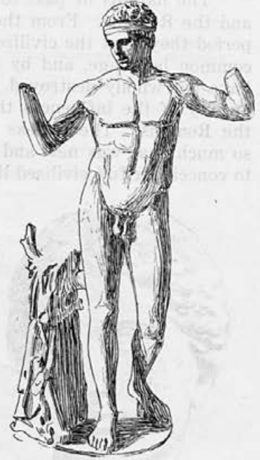
Hermes, Another Greek God of Commerce.