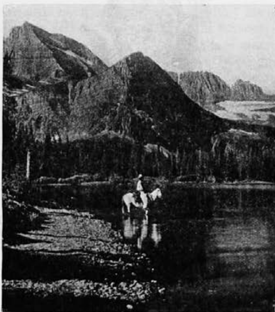
Na ljubkem jezercu v Glacier National Parku.

Čeprav vleče z usmevom svojega milega obličja materino hrepeneče srce k sebi, vendar spleta njegovo dobro vekanje nad malimi nadlogami dvojno vez sočutja in ljubezni.