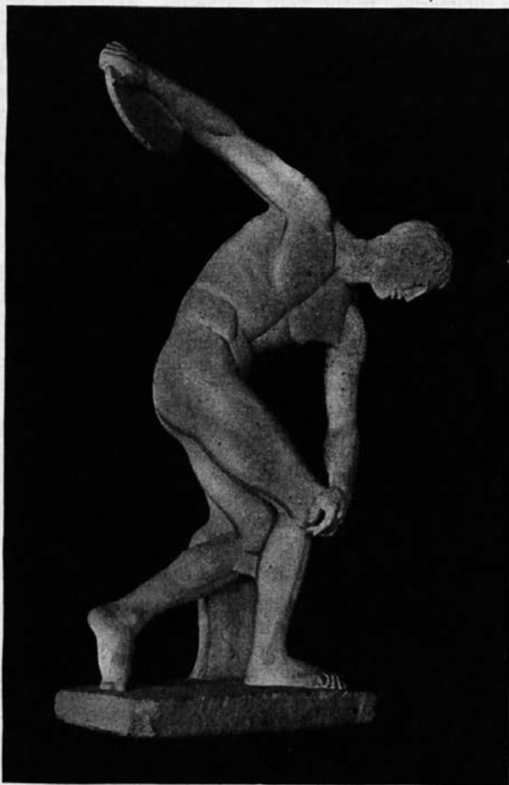
The Splendid Figure of a Disc-Thrower.

In architecture his greatest care was to secure beauty through just proportions. In that respect he is resembled by Japanese artists, who always place a beautiful object, however small it may be (perhaps only a simple flower) where its loveliness may be enhanced and not overwhelmed by its surroundings. Greek architecture is not massive and overpowering. The temples of the Greek gods were made worthy of their favor by the exquisiteness of the parts in relation to the whole.