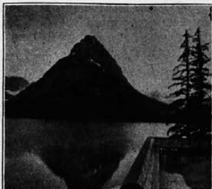
A Lovely Scene from the Montana Rockies.