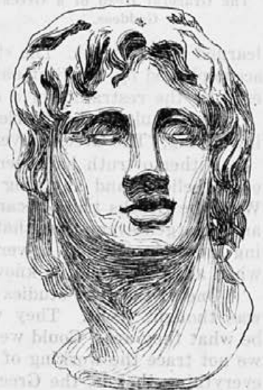
The Glorious Head of the Young Alexander.