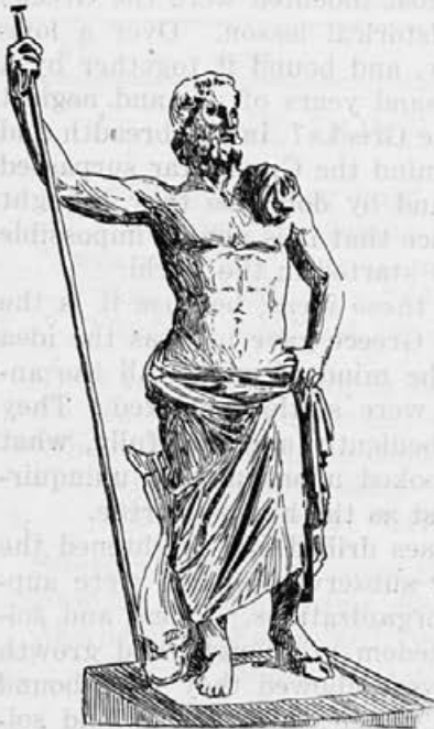
Poseidon, God of the Sea, Horses, and Chivalry.

(Illustrations by the Chicago Art Institute.)