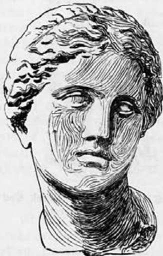
The Graceful Head of a Greek Goddess.

On the practical side their thinking led them to science. Science is simply knowing, with a practical bent. The sciences go to the Greek language for their very