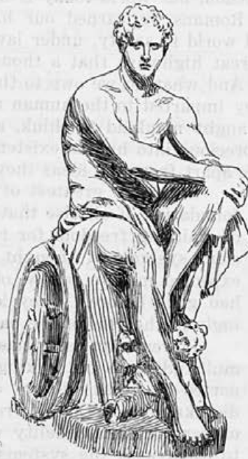
Ares with Eros, the God of War. The Romans identified him with Mars.