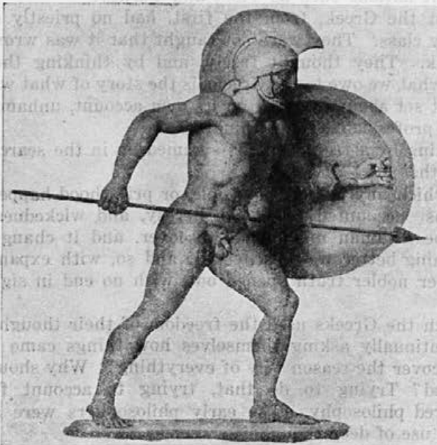
The Statue of an Ancient Greek Warrior.