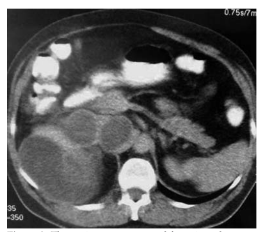
Figure 3. The patient was operated four times because of hydatid cyst. His CT scan shows RHC in the mesentery of the colon.

In thirteen (92.8%) of 14 patients studied, a subcostal incision was used. A midline incision was used for the remaining patient. At operation, we performed a complete removal of the contents of the hydatid cyst of