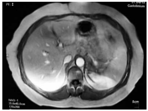
Figure 5. MRI appearence of the RHC on the left lobe of the liver.

The clinical presentation of RHC depends on the size and site of the lesion and the accessibility of the organ involved for the clinical examination.<sup>8</sup> The cysts may become infected and present themselves as liver abscesses. This complication has been reported in the literature as occurring in 5% to 40% of patients.<sup>9</sup> In our experience, clinical symptomatology consists of abdominal pain, nausea, fever and jaundice. It appears that jaundice is related to the presence of a communication between a cyst and the bil-