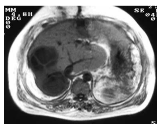
Figure 2. CT demonstrating the RHC of the liver and concomitant cyst of the splenic region. The patient was underwent splenectomy for splenic hydatid cyst in previous operation.

X-rays revealed an elevation of the right diaphragm in 3 (21.4%) cases. Abdominal US, CT (Figure 1) and MRI were utilized in 14 (100 %), 11 (78.5%), and 2 (14.2%) patients, demonstrating the RHC of the liver in all patients. According to Gharbi classification, the majority of the cases were Types 1, 3 and 2 (n = 9, 3 and 2 cases). Three (21.4%) patients from this group had associated hydatid cysts in other organs. The RHC was found in the left subphrenic space (Figure 2), the mesentery of the colon (Figure 3) and the perivesical region (Figure 4) in one patient. While one patient of the three had had a splenectomy as the treatment for a splenic hydatid cyst, the other two had been treated surgically for hydatid cyst of the liver, previously. Among 14 patients studied, the right lobe of the liver was affected in 11 (78.5%) cases, the left lobe in 3 (21.4%) cases. There were multiple liver cysts in 3 (21.4%) cases. The mean diameter of the cysts was 12 cm (range 3.5 to 15 cm). MRI was utilized successfully in 2 (14.4%) patients, respectively (Figure 5).