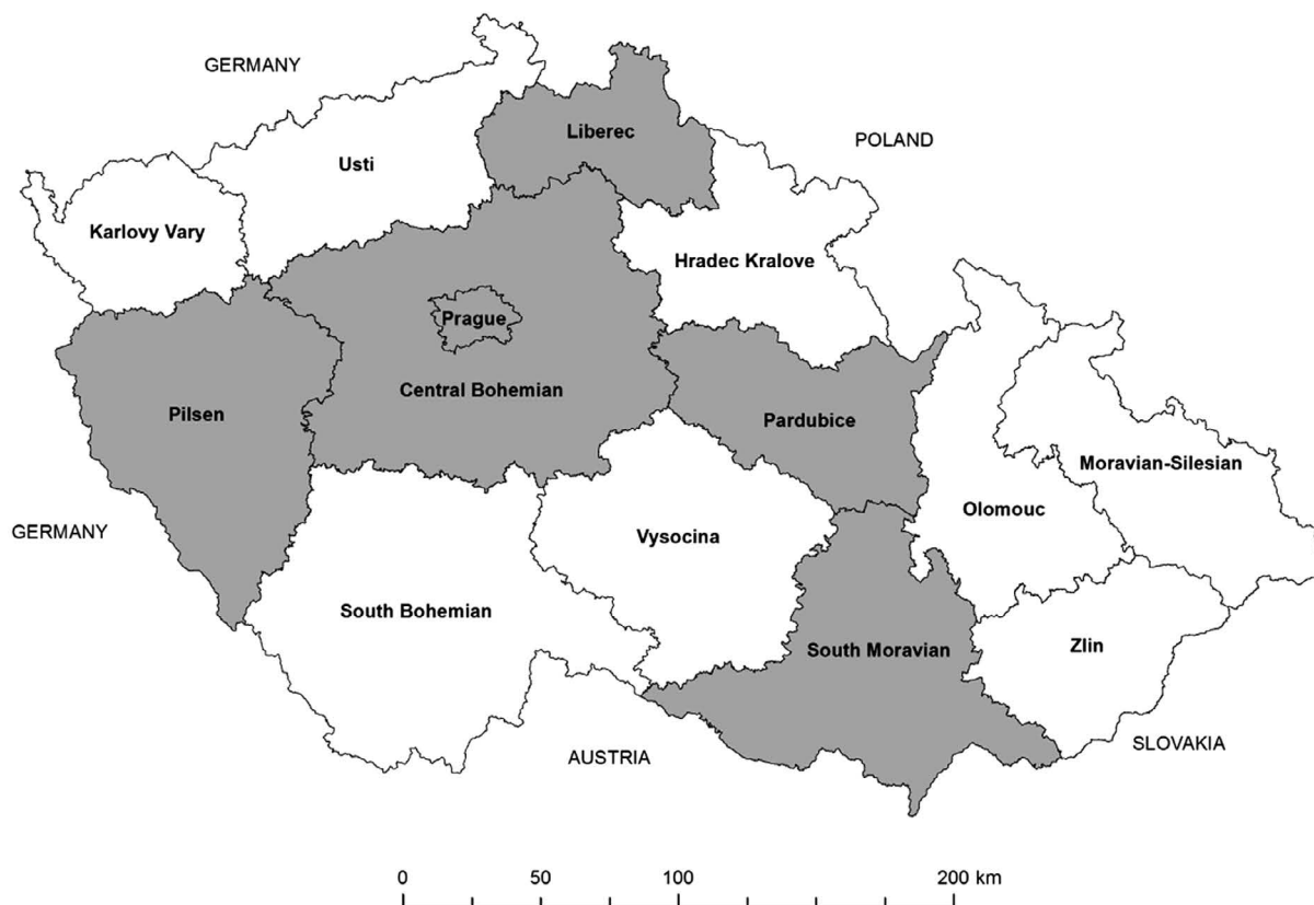
Figure 3: Czech metropolitan regions

As previously stated, the identification of a regional type enables better targeting of the innovation policy. Metropolitan regions should strive for greater cooperation among regional actors (through the formation of innovation