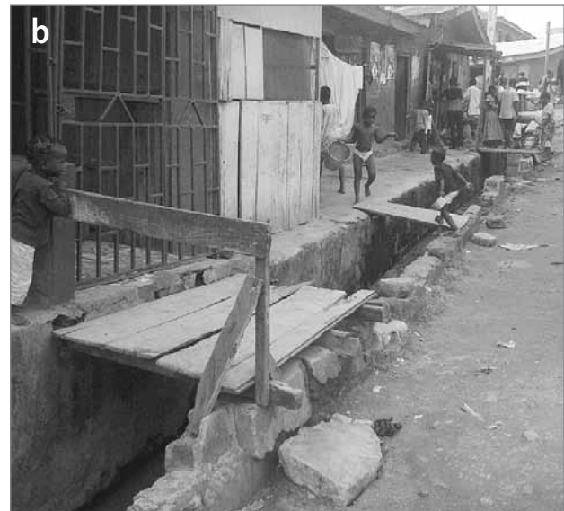
Figure 4: Storm-water drainage in Ayobo (adapted from Opoko, 2013).