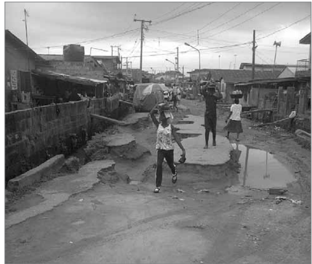
Figure 3: Dilapidated road in Ayobo (adapted from Opoko, 2013).