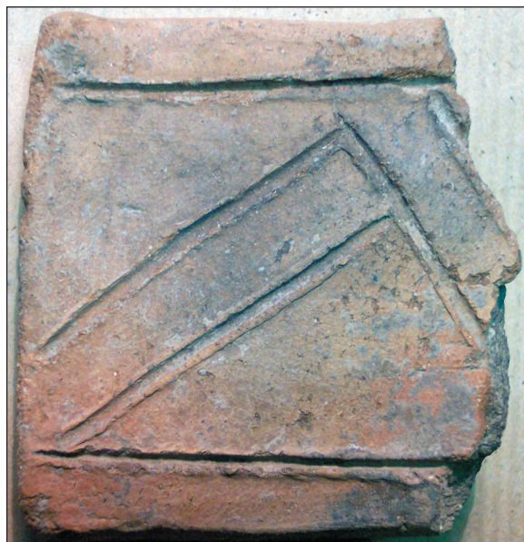
Fig. 2. 'Pintadera' fragment from the Final Neolithic inhumation cemetery at Cala Tramontana, San Domino island, South-East Italy. Zorzi collection, Museo Civico di Storia Naturale, Verona.

unified and perhaps also subtly differentiated, by patterns of resemblance and contrast established over long distances of time and space.