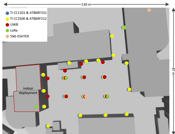
Fig 3. Locations of available radio interfaces in outdoor environment

enabling Internet connectivity. Current implementation of TSCH and 6TiSCH supports so-called "minimal configuration", which only defines a basic RPL+TSCH network [10].