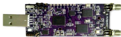
Fig. 2: OpenMote-B device [5].

The OpenMote represents a new generation of open hardware platforms that is particularly adapted to the IIoT applications. Currently, a new board called OpenMote-B is being released, Fig.2. It provides a dual-radio interface for short and longer range communications, combined on one board. OpenMote-B incorporates the new Atmel AT86RF215 radio transceiver, which can operate simultaneously in the Sub-GHz (868/915 MHz) and the 2.4 GHz ISM bands, and supports all physical layer modes of the IEEE 802.15.4g standard (i.e., MR-FSK, MR-OFDM, MR-O-QPSK and OQPSK) with data rates ranging from 6 kbps to 2 Mbps. This is the first board that fully supports the IEEE 802.15.4g standard including MR-OFDM modulations for robust communications.