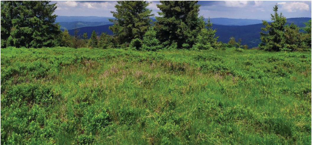
Figure 4: An ambiguous identifiable highest point in Mędralowa.

The levelling instrument was set between the potentially highest points, and the measurement was performed in the same way. Then, after analysing the obtained differences, the highest point was selected, and a static or RTK measurement was performed.