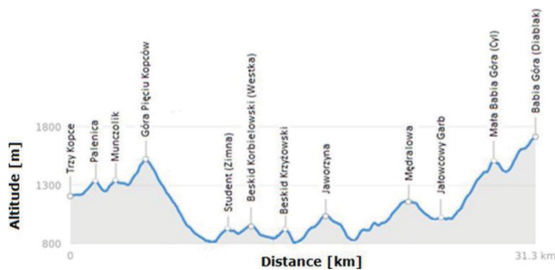
Figure 2: Profile of selected route of measurement ( https://mapa-turystyczna.pl ).