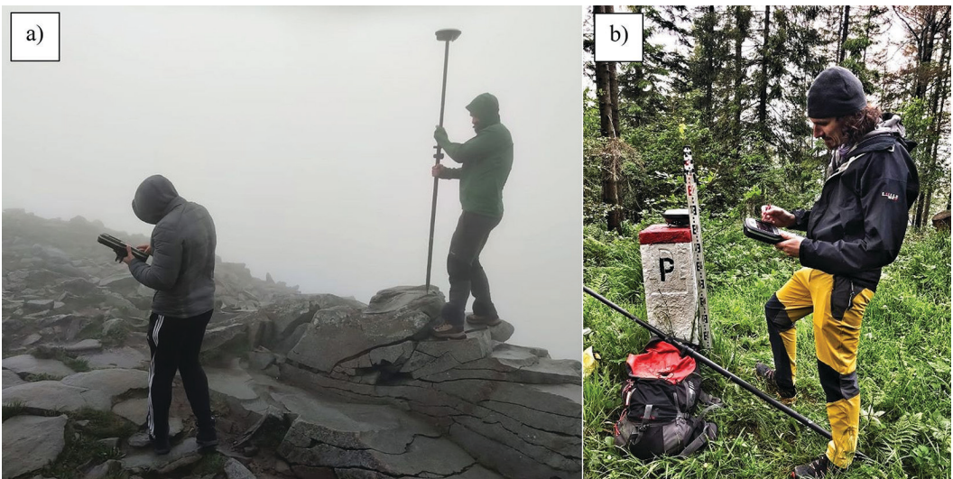
Figure 5: GNSS measurements at the Babia Góra (a) and the Jalowcowy Garb (b).

The measurement trip took place on June 23, 2020; measurements were performed by two independent field teams using three Leica GS16 receivers. The first stage was to reach the top of each mountain, select the highest point, and proceed with the RTK measurement, if the sky visibility was sufficient. If the fix solution was unavailable, static measurement was performed, or the eccentric point was determined. Figure 5 shows the weather conditions during RTK measurement at the Babia Góra (left) and on the Jalowcowy Garb (right). The time difference between measurements at those two points is only 2 hours.