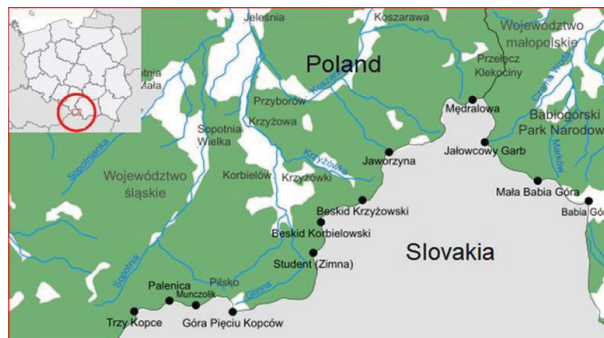
Figure 1: Mountain peaks (black dots) location on the Polish-Slovak border (Map layer from (GUGiK 2022).

Beskid Żywiecki is located in the south of Poland. It is the highest mountain group of the Polish Beskids and at the same time, the second-highest massif in the entire Western Carpathians (Solon et al. 2018). In this region, there are the peaks of Babia Góra and Pilska, the only ones in Western Beskids that rise above the forest line. This mountain range is made of sedimentary rocks known as flysch. Flysch is an alternating sequence of the grey colour of sandstones, and sometimes also conglomerates and clayey (Łoboz 2013). The selected 12 mountain peaks are located on the Polish-Slovak border in the Śląskie and Małopolskie voivodships (Figure 1, selected peaks – black dots).