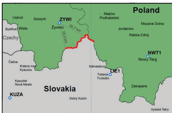
Figure 3: ASG-EUPOS reference stations (GUGiK 2022).

In this paper, each peak was measured by direct (field) measurements using dual-frequency GNSS receiver Leica GS16. On the peaks where a fix (precise) solution is available, RTK mode was used (six peaks) for three independent measurements of 30 s. Final altitude is a mean from these three values. In the case of obstructed view due to sky conditions and GSM signals, 1 h static GNSS measurements were made (six peaks). After that, in a post-processing using Leica Geo Office 8.4 (LGO) software altitudes were determined. On the peaks where the highest point was covered by trees or was impossible to lay on it GNSS antenna, an eccentric point (with good sky visibility), was established. With the use of geometric levelling, altitude differences between the top of the peak and eccentric point were determined. When GNSS was placed on the geodetic mark (Figure 5b) altitude was also reduced by height of the geodetic mark, to enable comparison with other measurements. In an RTK mode, the authors used the ASG-EUPOS ( http://www.asgeupos.pl ). On the selected territory, the nearest station was ZYWI (Zywiec, blue dot), located 18 km to 26.7 km from the selected mountain peaks (Figure 3).