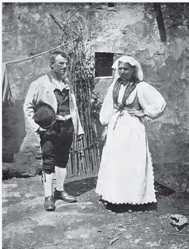
Figure 3: The traditional clothing of the rural population in the Furlan part of Gorizia and Gradisca