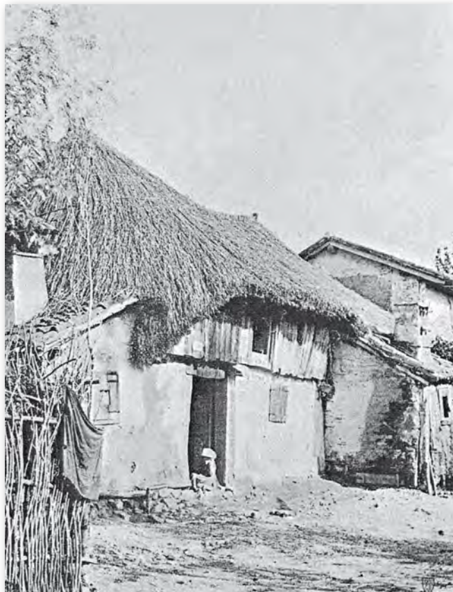
Figure 2: An example of a peasant house in the Friulian part of Gorizia and Gradisca. At the end of the 19 th century, dwellings were often still covered with thatch, without flooring, separate rooms, proper ventilation, heating and access to light.