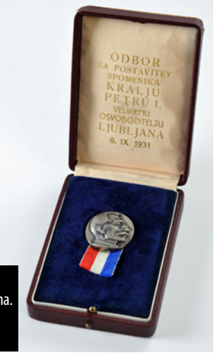
Figure 4: Memorial badge received for the erection of the monument to Peter I. in Ljubljana

the loud cheering of the crowds as the monument was unveiled (Govor ..., 1931). What Ljubljana obtained with Dolinar's statue, is its first equestrian monument, many European cities already boasted (Jezernik, 2014).