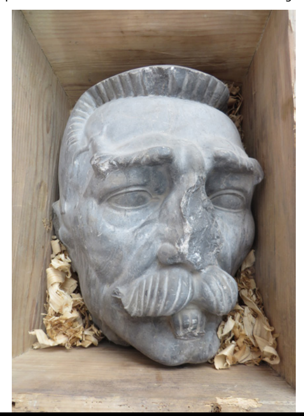
Figure 6: Shortly after the occupation of Ljubljana in 1941, the Italians removed the statues of kings Peter I. and Alexander I. They promised that both statues were to be moved to the National Museum, but both statues were destroyed. In the photo, the head of Peter I., which has been preserved and is now kept in the Museum of Contemporary History of Slovenia.

Alexander's monument erected by the Sokol Society hall was a full-figure figure. This was another statue funded by the Sokol Society, namely by the Trbovlje charter and a couple of other societies. The leadership of the society raised funds among their members and other people from Trbovlje and commissioned the production of a bronze statue more than two meters high.