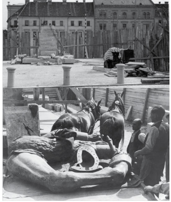
Figure 7: Italians demolish the statue to King Alexander I. in Ljubljana.

»The Karadordević monuments were erected as expressions of gratitude to the kings who had liberated the Slovene nation. At the same time, they glorified the ruling dynasty and symbolized the idea of Yugoslavism« (Komić Marn, 2013, p.93). A review of the monuments shows that the figurative (thus the most luxurious) monuments dedicated to the kings Peter I. and Alexander I. were not exclusively a matter of larger settlements and that their location was carefully chosen in every case. The statues adorned local centers, central parks, or Sokol Society halls. Several monuments were strategically erected along the state border, where they were supposed to encourage the Slovenes and other Yugoslavs while acting as a reminder to hostile foreigners. The list of sculptors and architects who designed and created the monuments is full of distinguished names of the Slovenian interwar sculpture and architecture milieu, which points to the strict scrutiny enjoyed by said monuments. Even though the monuments were in the service of propaganda meant to