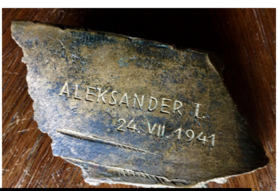
Figure 8: A small remnant of Alexander I. bronze monument.

strengthen the power of the state, they were also works of art, thanks to carefully selected authors. Unfortunately, none of the monuments described is preserved. During the World War II occupation, statues depicting the former royal dynasty were an unwanted memory of a bygone era in the eyes of the occupiers and were therefore destroyed in the first weeks and months of the occupation (Figures 6–8; Mikša, 2018).