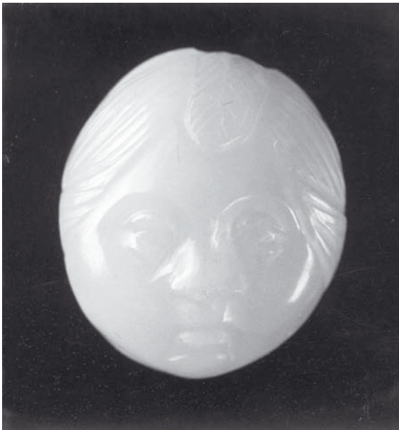
Fig. 2: Mokino near Perm. The Roman military phalera.