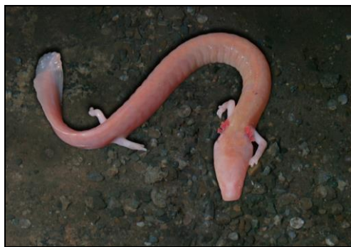
Figure 1. The olm in Hermann's Cave.

Since 1931, live individuals of Proteus anguinus , the proteus or olm (Fig. 1), have been kept in an artificial environment in the show cave Hermannshöhle (Hermann's Cave) in Rübeland, Harz Mountains, Sachsen-Anhalt, Germany. In 1956, more animals were brought to Rübeland. Originally all animals came from the Postojnska jama and were brought unlawfully to Rübeland (Völker 1981). A total of 20 animals were taken to Rübeland over a period of 25 years (Knolle et al. 2016). In 2015, almost 60 years after the last animal had been put into the artificial lake in the cave, nine of the animals were still alive.