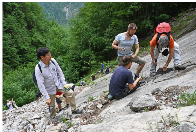
Fig. 8. Field trip participants collecting decapods from Triassic laminated limestones in the Logarska Valley.