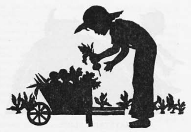
VEGETABLES FOR DINNER

Only volunteers are accepted in the Seabees.