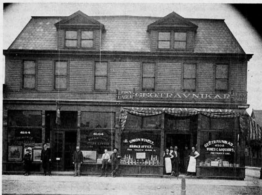
St. Clair Avenue at East 61st Street was a busy corner as this photo of a typical storefront in 1915 shows.