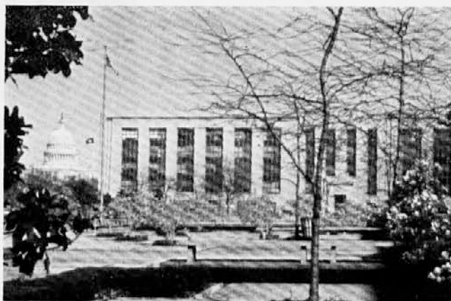
Iz tega poslopja se vršijo radijske oddaje Glasa Amerike v Slovenijo in po vsem svetu.