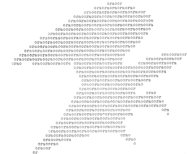
Figure 1: Dragoš Kalajić, Wreckage , visual poem “The Eagle”