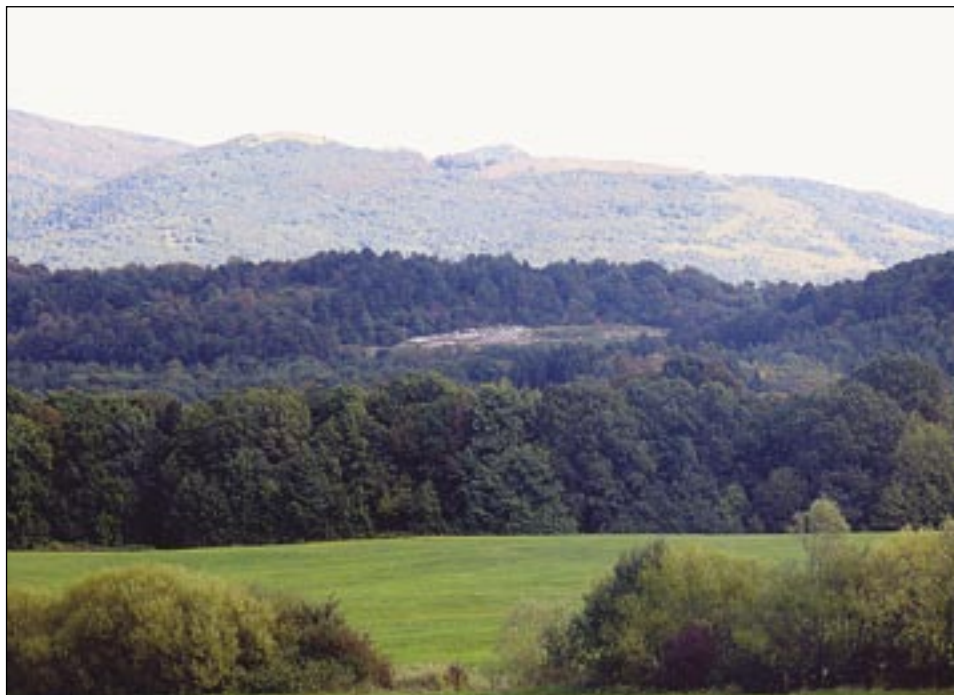
Figure 5: Stara vas landfill.

But by such seasonal sampling occasional problems with water quality can be overlooked. After stronger precipitation events more intensive washing out of contaminants from the landfill as well as flushing out of previously stored polluted water from the vadose zone below the landfill can be expected, therefore additional, more detailed sampling during a selected water wave after first