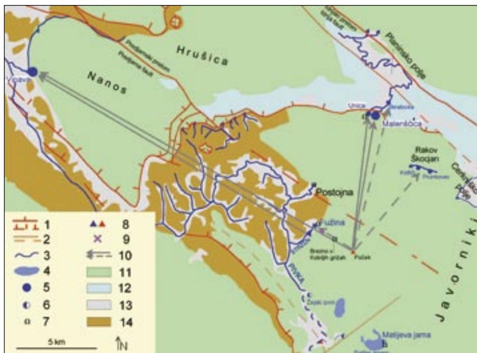
Figure 2: Hydrogeological map of the broader area of the landfill with the results of tracer tests (Legend: 1. Visible and covered thrust plane, 2. Visible and covered fault, 3. Surface stream, 4. Intermittent lake, 5. Permanent spring, 6. Intermittent spring, 7. Karst cave, 8. Ponor or injection point, 9. Landfill, 10. Main and secondary underground water connection, proved by tracer test, 11. Karst aquifer, 12. Fissured aquifer, 13. Porous aquifer, 14. Very low permeable rocks).

On northern and eastern side Javorniki are bordered by the Planinsko polje, Cerkniško polje and Rakov Škocjan. These are typical karst features for which surface flow in connection with underground flow in surrounding massifs is characteristic. The bottom of Planinsko polje and Cerkniško polje is built by Upper Triassic dolomite, which is less permeable than limestones. Both poljes are cut by the fault zone of the Idrija fault, which acts as hydrogeological barrier. Along it karst waters outflow through several springs, flow on the surface across the polje, and sink again underground.