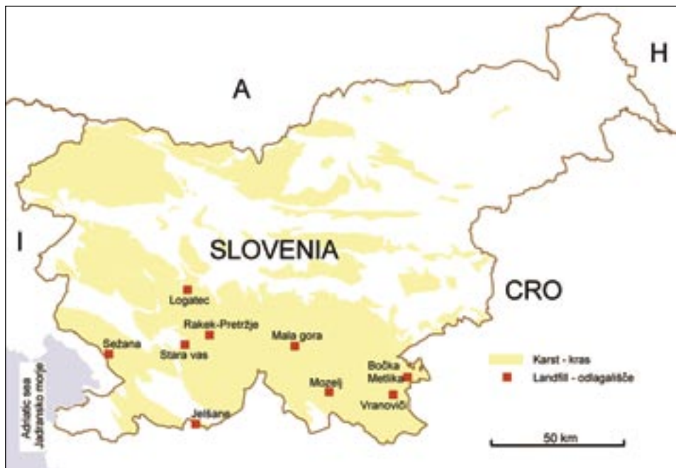
Figure 1: Landfills on karst in Slovenia. Slika 1: Odlagališča na krasu v Sloveniji.

Upper Cretaceous limestones of Javorniki massif are well karstified and form the main karst aquifer with dominant groundwater flow (Fig. 2). On its western side in the lower Pivka valley surface drainage net is developed on less permeable Quaternary alluvial sediments and Eocene flysch. In its upper stream the Pivka river flows partly on the surface and partly underground along the western edge of the Javorniki mountains. At high waters several karst springs are activated along it and also