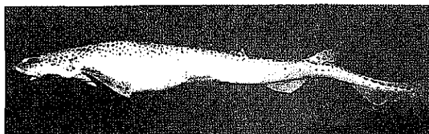
Fig. 1: Small-spotted catshark Scyliorhinus canicula , caught on December 1 st 2000 in coastal waters off Barcelona.

A female small-spotted catshark Scyliorhinus canicula (Linnaeus, 1758) (Fig. 1) was caught in Catalonia's continental slope waters on December 1 st 2000 by "Maireta II", a fishing vessel based in the port of Barcelona (Spain). The specimen was caught with a trawler net, at a depth of 200 m, on the fishing ground known as "La Serola", at a geographical position of 41° 15' N - 2°