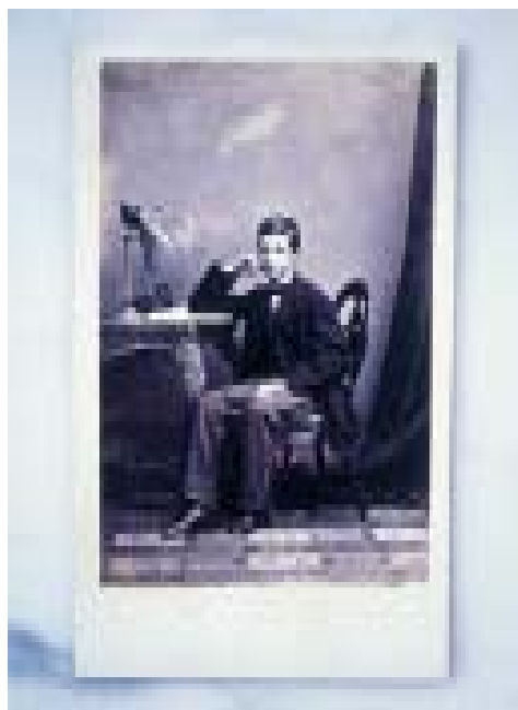
Fig.6: Ludwig Salvator at the age when he visited the Postojna caves in 1863 (privat collection).