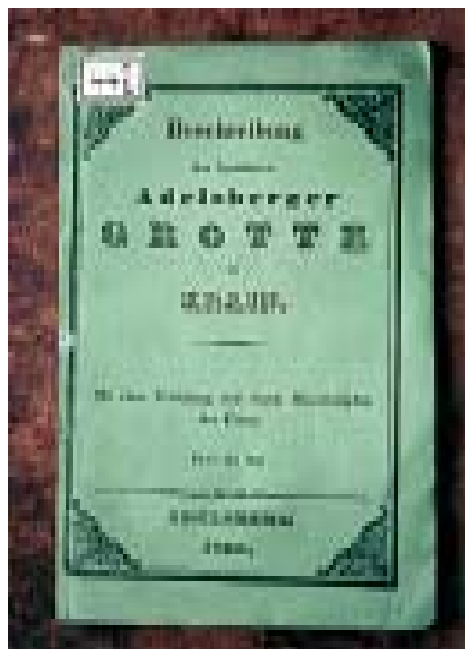
Fig.7: The guidebook Beschreibung der berühmten Adelsberger Grotte in Krain. Mit einer Einleitung und einem Situationsplan der Grotte. Adelsberg 1863 Ludwig Salvator got.