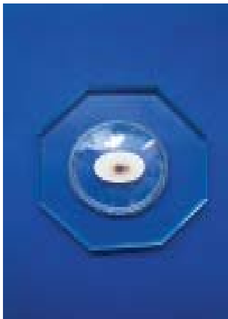
Fig.3: the Montignoso preparation.