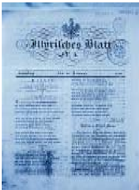
Fig.4: Illyrisches Blatt.