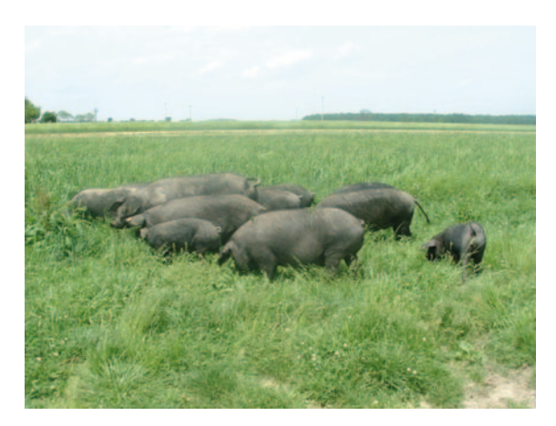
Figure 2: Pigs on the pasture.

In the case of Black Slavonian Pigs, extensive system of pig production refers to outdoor systems with shelters and pastures (Fig. 2). Area of 1 ha may hold up to 4 breeding sows (along with fattening pigs, piglets, gilts and boars). Production area must be split into partitions, and facilities that are located on that area must be constructed from natural materials and in a traditional style. Facilities for sows and gilts depends on the number of animals and for five sows or gilts, (Fig. 3) according to few authors Karolyi et al. (2010); Karolyi et al. (2004), Margeta (2013) should be semi-opened area of 30 m<sup>2</sup>.