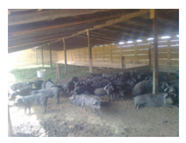
Figure 3: Facilities for sows and gilts.

The floor should be covered with litter. Animals are fed in troughs or on the ground, while the drinking water can be supplied by different waterers or water wells. Farrowing units consist of farrowing pens with size 6\ m \times 1.5\ m . Piglets stay with a nursing sow for 7 weeks before weaned. At weaning, sows return into groups for mating. Weaners are kept in a separate unit in groups. Facilities should be fenced with wire mesh to 100\ cm in height or with an electric shepherd. Fattening lasts up to the age of 1.5\ years when pigs weigh between 130-150\ kg .