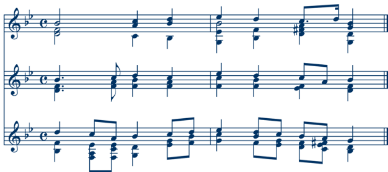
Examples 2–4. Example 2: Ivan Zajc: Nikola Šubić Zrinjski, Introduction, m. 1–2. Example 3: Joseph Haydn: Kaiserhymne, m. 1–2. Example 4: Davorin Jenko: Srpska himna (Serbian anthem), m. 1–2.

The quotation appears several more times during the opera, and the last of them is at the beginning of the farewell duet of Zrinjski and his wife Eva (No. 30) in the manner of the Glinka’s concluding chorus “Slavs’ja” from his opera Жизнь за царя (A Life for Tsar), fortissimo in tutti orchestra, in Pesante ritenuto , in octaves. The mentioned “national-international” (Croatian–Hungarian/German) ambiguity in Nikola Šubić Zrinjski shows one more important dimension of the national opera: ambiguity of the national versus imperial identity.