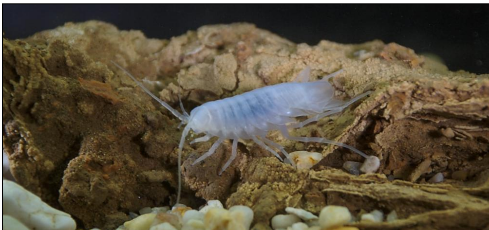
Figure 3. Sphaeromides virei mediodalmatina from the river Ruda spring in southern Croatia. Slika 3. Sphaeromides virei mediodalmatina iz izvira reke Rude na jugu Hrvatske.

There are several assumptions that could throw light on why this subspecies was found never again after 1956. We present only the most plausible ones. First, a (sub)population of Sphaeromides from Obodska pećina could live at the edge of the (sub)species range. Such marginal (sub)populations often exhibit sub-optimal habitats (according to suitability) and consequently, they often occur at low abundance and are more sensitive to habitat changes (Hanski 2012). According to Cukrov and Ozimec (2014), the nearest S. v. cf. montenigrina population should be present in the cave system Vilina špilja – izvor Omble near Dubrovnik (Croatia). Subsequent identification of those specimens as S. v. mediodalmatina (not published) left Obodska pećina as the only known locality for S. v. montenigrina . That, however, doesn't exclude the possibility of more stable subspecies populations existing at yet unknown or inaccessible places.