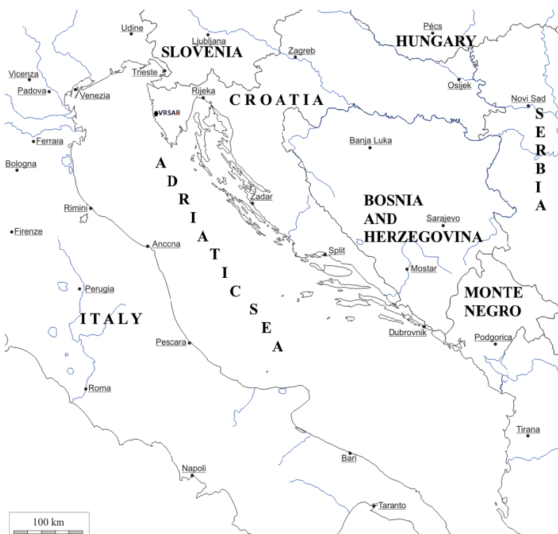
Figure 1: Geographical location of Vrsar on the northern Adriatic littoral