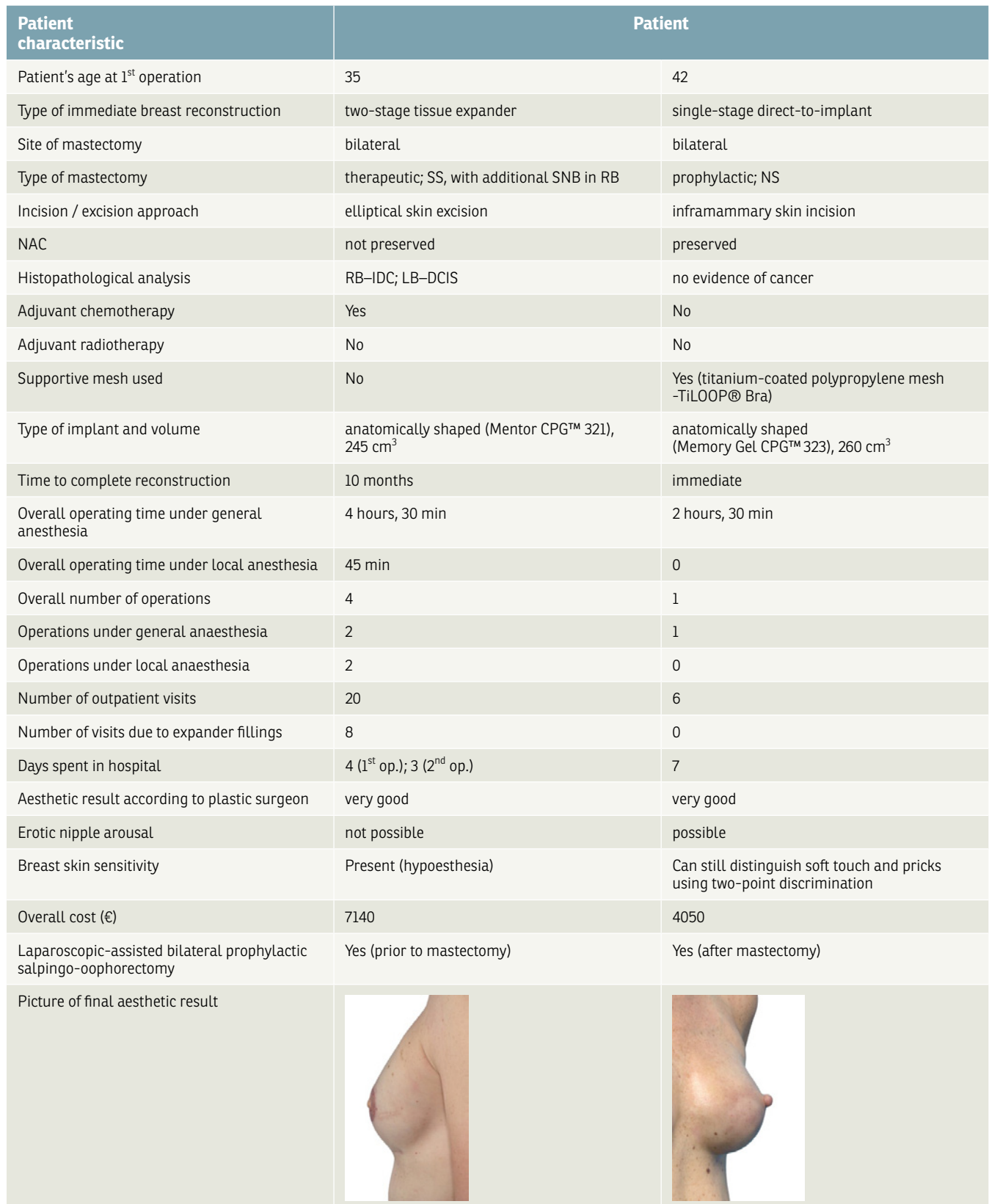
Table 1: Comparison of immediate two-stage tissue expander breast reconstruction with single-stage direct-to-implant breast reconstruction characteristics in identical twins with a BRCA 2 mutation.

SS – skin sparing; NS – nipple-sparing; SNB – sentinel node biopsy; RB – right breast; LB – left breast; IDC – invasive ductal carcinoma; DCIS – ductal carcinoma in situ; NAC – nipple areola complex.