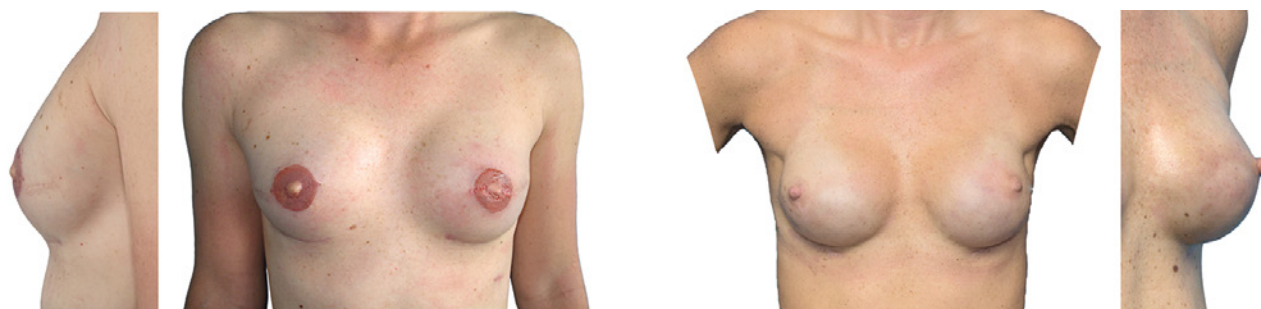
Figure 2: Final result of immediate two-stage tissue expander breast reconstruction (left-sided pictures); and of immediate single-stage direct-to-implant breast reconstruction (right-sided pictures).

mammary approach with a 7 cm long incision. Weight of each removed breast tissue was 130 g. Next, a plastic surgeon continued with a single-stage bilateral reconstruction and inserted permanent anatomically shaped silicone implants ( Memory Gel CPG™ 323 ; 260 cm 3 ). Titanized mesh implant TiLOOP® bra was used to cover and secure the position of the breast implant and to fix the pectoralis major muscle (Figure 1). The operation under general anesthesia took two hours and a half. The patient stayed in the hospital for seven days. There were no complications in postoperative recovery and wound healing.