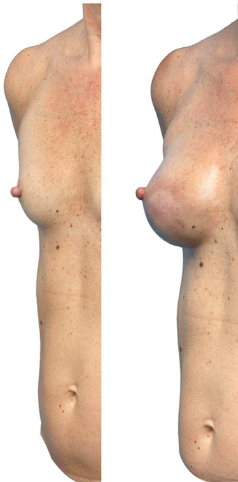
Figure 3: Pre- and post-operation pictures of single-stage direct-to-implant breast reconstruction.

not be calculated, because the data did not capture the possible complication of the 2 nd operation of two-stage expander-implant breast reconstruction. They also did not mention which types of supportive mesh were included in single-stage breast reconstruction. In this study the early difference was most evident in reconstruction-related implant loss, followed by wound dehiscence at the incision site. 1 Predisposing factor for such early revision rate could be increased breast cup size compared to smaller breast cup sizes, obesity and prolonged operative time. 8,17