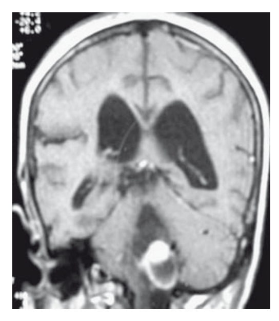
FIGURE 1. Coronal T1 post-contrast MR image shows a large cystic tumour with enhancing mural nodule in medulla oblongata. There are surgical changes in the posterior fossa with dilated fourth and lateral ventricles.

underwent radiosurgical ablation (gamma-knife) therapy twice. She has been stabile for three years. The father and the other five siblings were found to be free of the disease.