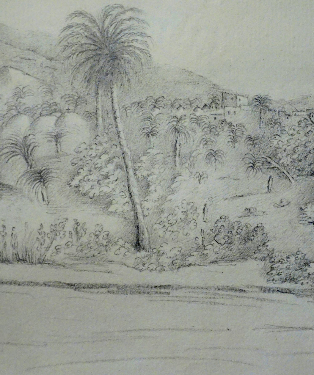
Figure 5. Walls of St. Anthony's monastery, James Burton papers. Add. mss 25,628, f. 102.