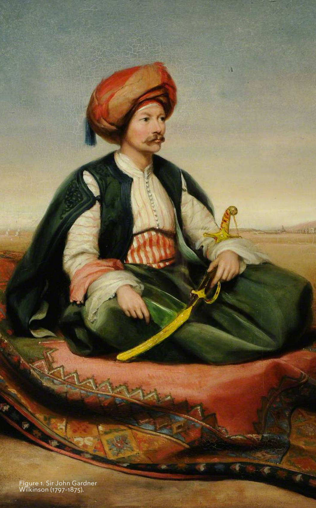
Figure 1. Sir John Gardner Wilkinson (1797-1875).