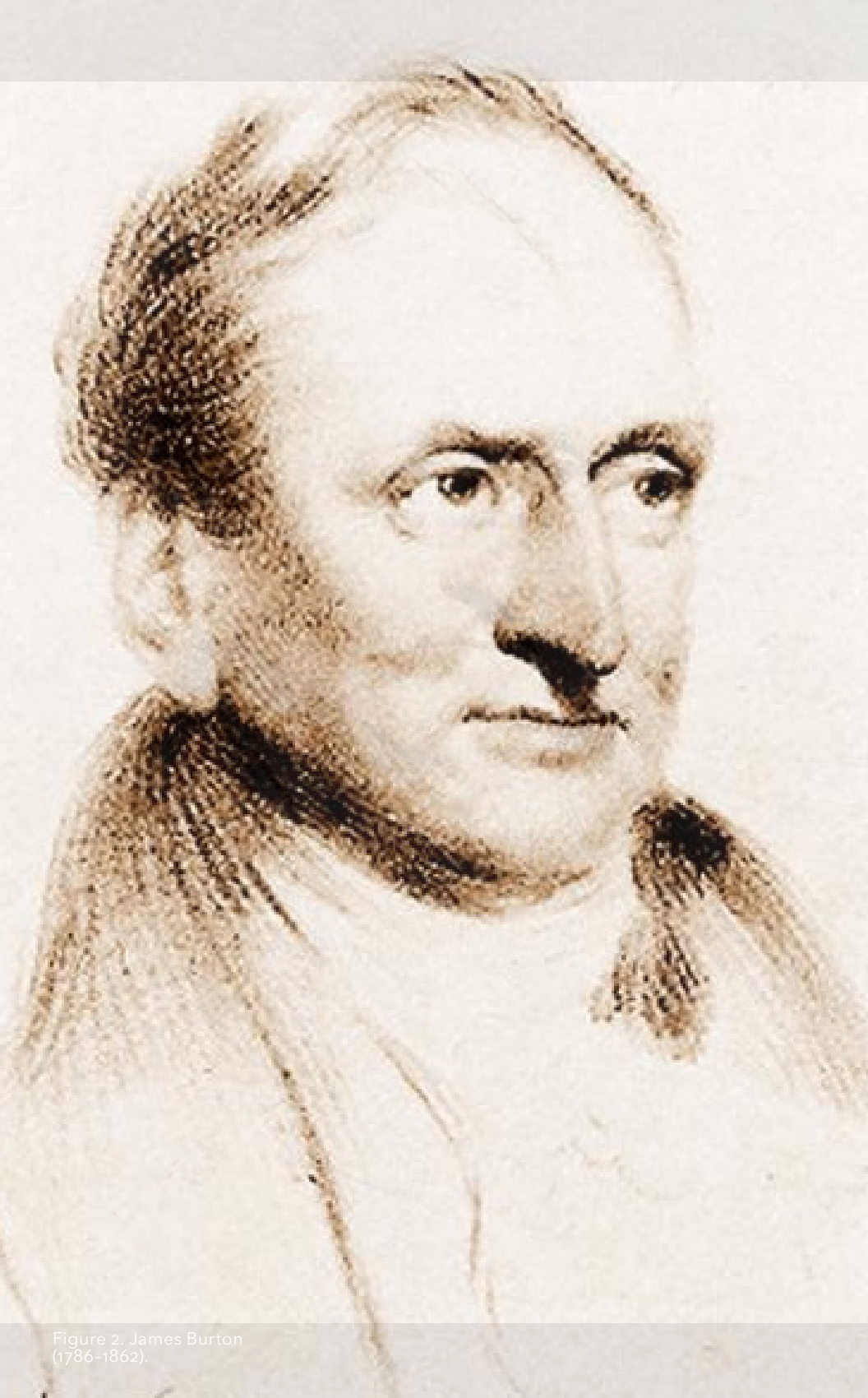
Figure 2. James Burton (1786-1862)