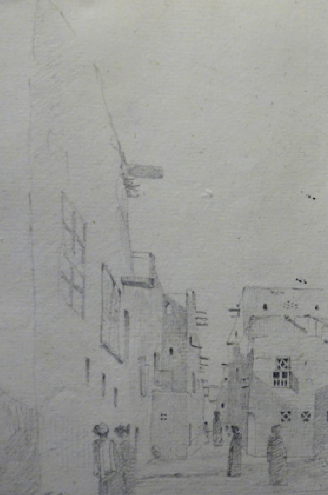
Figure 8. Interior of St. Paul's monastery, James Burton papers. Add. MSS 25,628, f. 112.