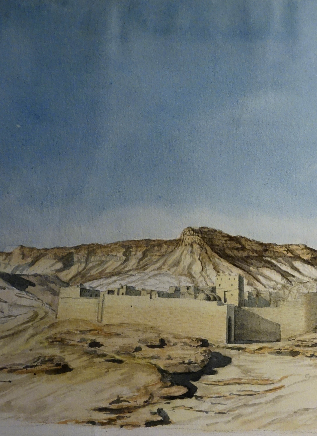
Figure 6. Panorama of St. Paul's monastery, James Burton papers. Add. mss 25,628, f. 107.