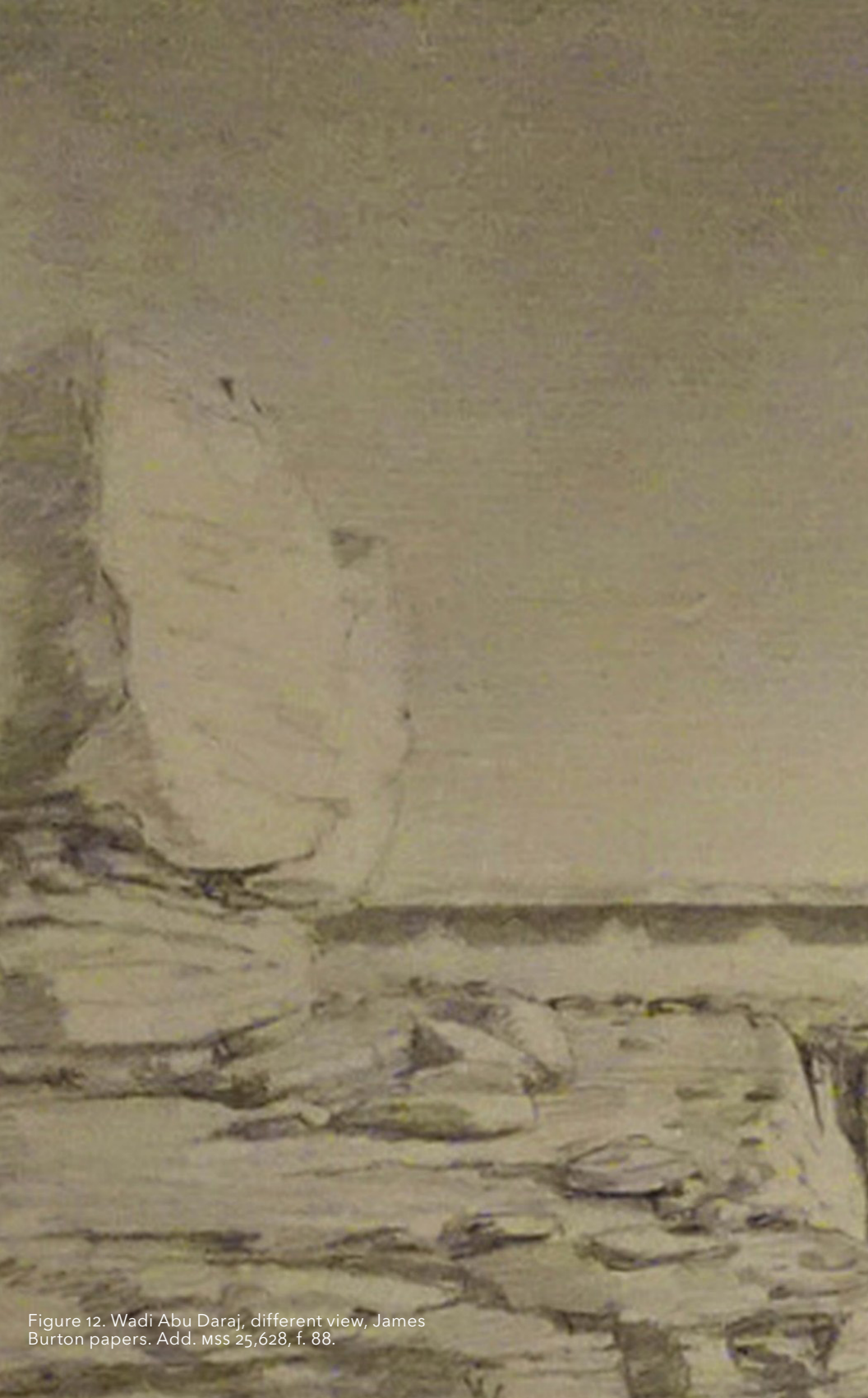
Figure 12. Wadi Abu Daraj, different view, James Burton papers. Add. mss 25,628, f. 88.