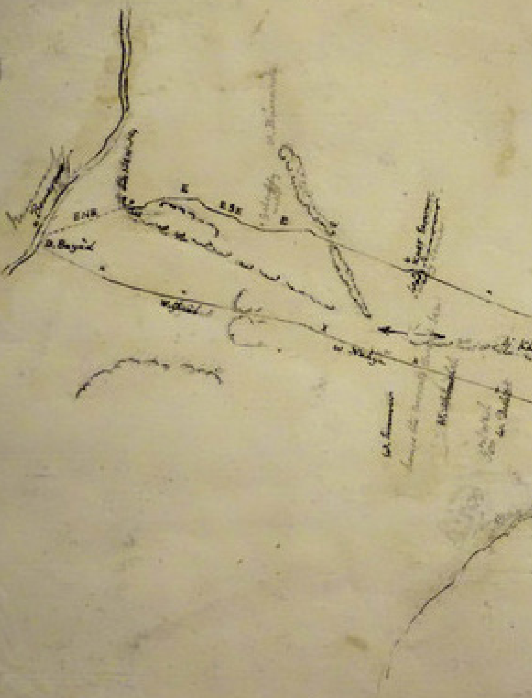
Figure 3. Map of Wadi Arabah, James Burton papers. Add. mss 25,628, f. 50.