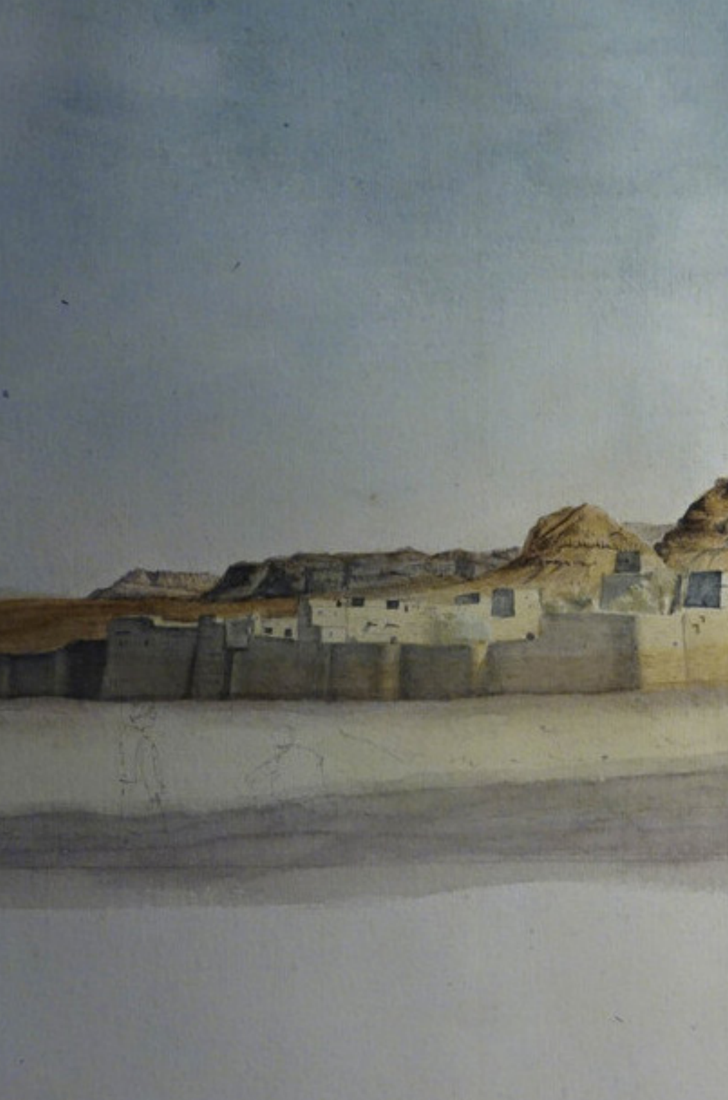
Figure 4. Panorama of St. Anthony's monastery, James Burton papers. Add. MSS 25,628, f. 100.