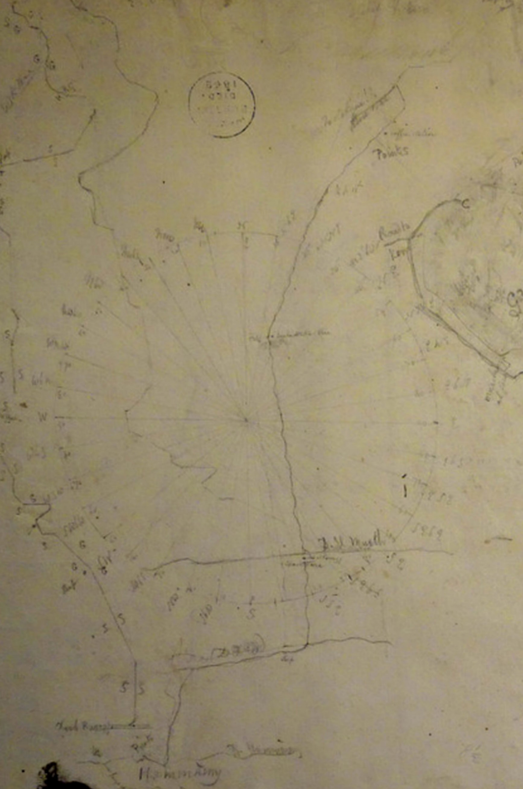
Figure 10. Map with marked hermitage in Wadi Naqqat, James Burton papers. Add. mss 25,628, f. 137.