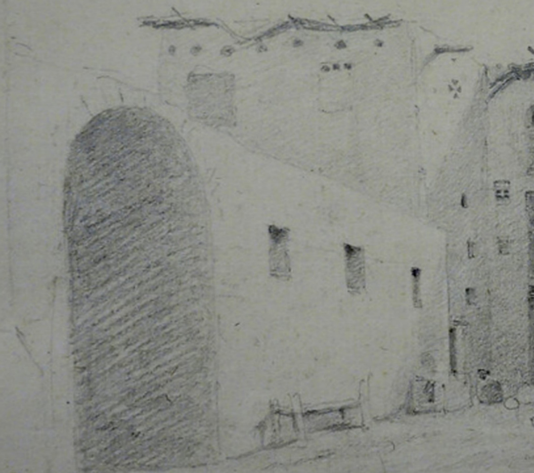
Figure 9. Interior of St. Paul's monastery, different view, James Burton papers. Add. mss 25,628, f. 110.