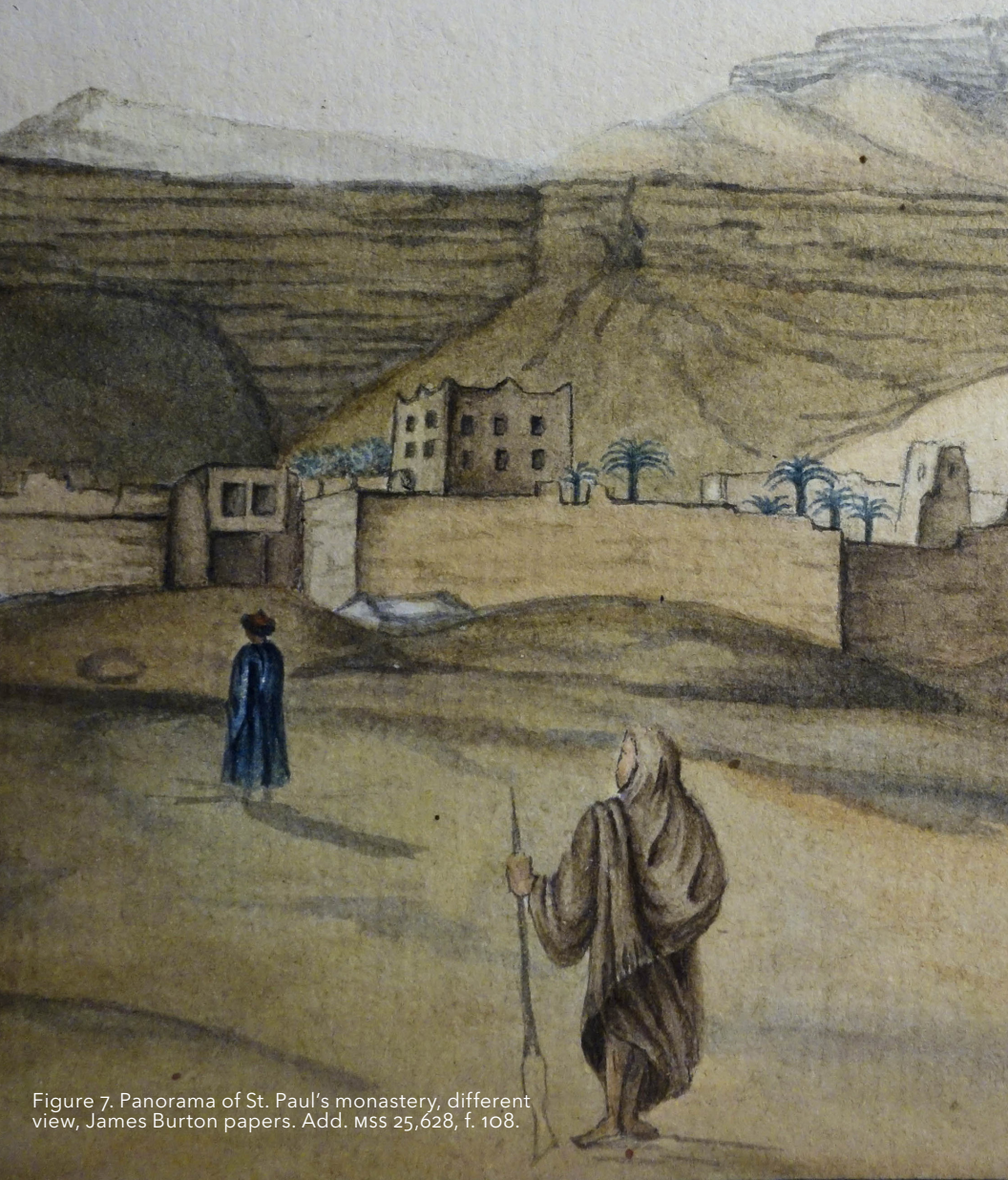
Figure 7. Panorama of St. Paul's monastery, different view, James Burton papers. Add. mss 25,628, f. 108.