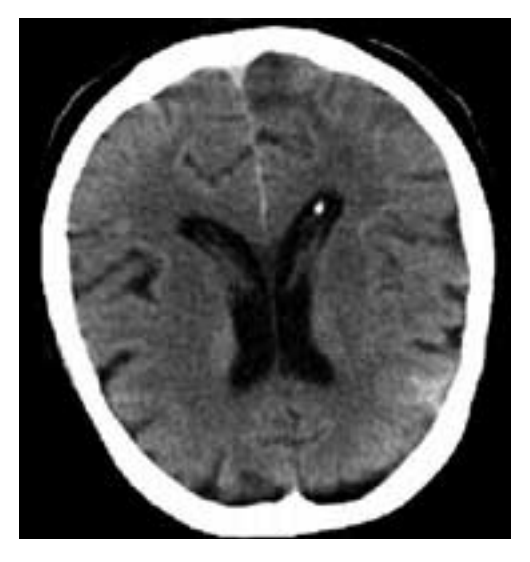
Figure 2. CT of the brain demonstrates small haemorrhage in the left frontal region.