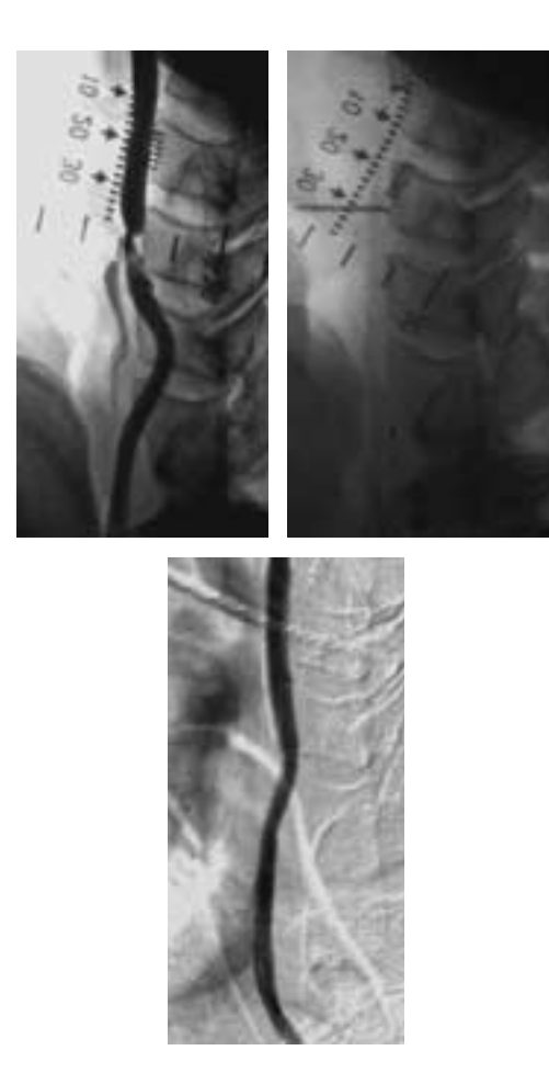
Figure 3. Digital subtraction angiography. Lateral views of the left carotid artery bifurcation. A. 90% stenosis of left internal carotid artery before CAS. B. Cerebral protection filter device during CAS. C. No residual stenosis after CAS.

to a lipid-laden plaque and the occluded right carotid artery. In this case we used a cerebral protective filter. CAS was successfully done (Figure 3). Cerebral embolism occurred during the filter removal. He became aphasic and had hemiplegy. We dissolved embolus on bifurcation of middle cerebral artery with intra-arterial thrombolisis using rTPA (Figure 4).